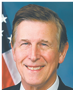
Rep. Don Beyer (D-8)

R ep. Don Beyer (D-8), a longtime supporter of the Equal Rights Amendment (ERA), and cosponsor of legislation to extend the deadline for ratification, issued the following statement after the Virginia General Assembly voted to ratify the ERA: "Today, Virginia became the 38 th state to ratify the Equal Rights Amendment, and I could not be more proud. Ratification of the ERA is long overdue, but it is wonderful that Virginia took the historic step today which brought the Amendment across the three-fourths threshold necessary for ratification.