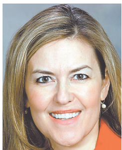
Rep. Jennifer Wexton (D-10)

I n response to the final passage of the Equal Rights Amendment in the Virginia General Assembly, Rep. Jennifer Wexton (D-10) issued the following statement: "Today, Virginia sent a powerful message to the rest of the country — that 'Equal Justice Under Law' is a constitutional right for women.