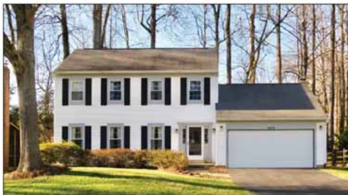
Burke • List Price • $685,00

NEW LISTING • UNDER CONTRACT IN 3 DAYS! MULTIPLE OFFERS!