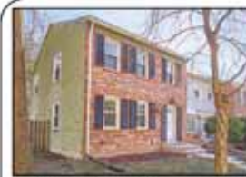
Springfield Newington Station $369,900

Serving VA/DC since 1988 NVAR Lifetime Top Producer