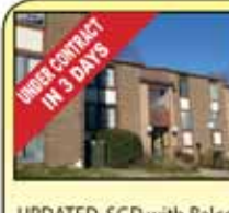
Fairfax $280,000 Hawthorne Village Great Location and Beautiful Condition