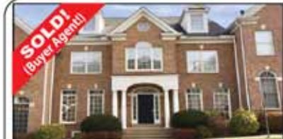
Fairfax City/Farrcroft $875,000

Beautifully updated 3 bdr in sought-after Farrcroft. 2,897 sq ft, 4 BR, 4.5 BA, updt Grmt Kit, Liv, Din, HDWDS, updt BA's, fenced Courtyard, 2 car Gar.