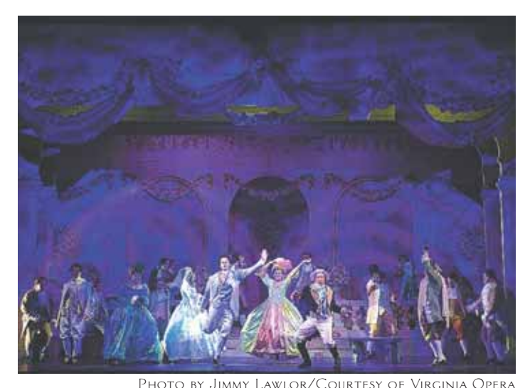
Cast of Virginia Opera's production of Rossini's "Cinderella/"