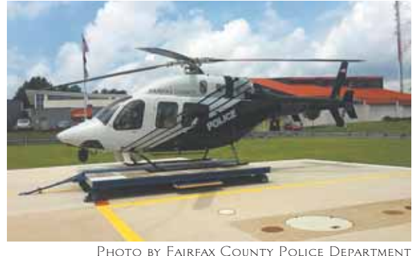
The police helicopter flies out to missing persons reports, gunshots, boating incidents and fugitives on the run.

The heliport is part of a larger county operations area to include the Fairfax County