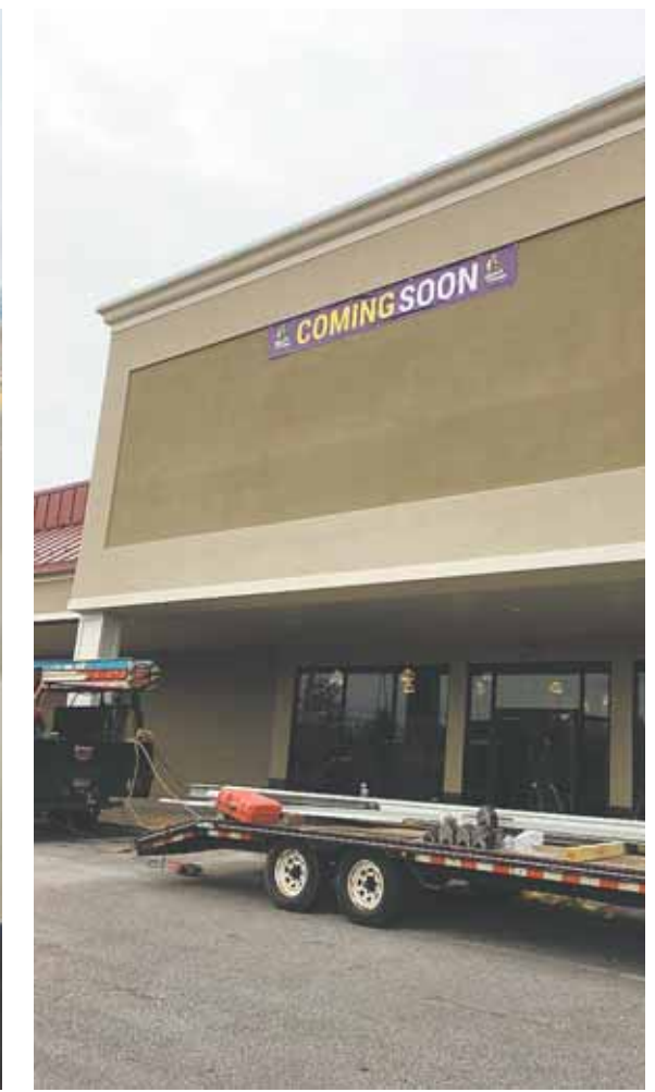
Planet Fitness is a "Judgement Free Zone," they say.