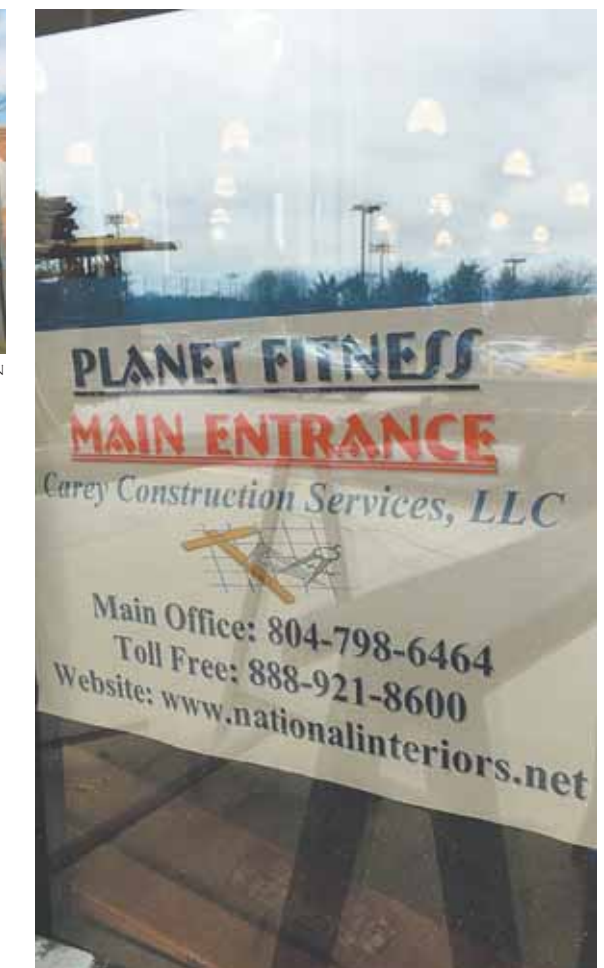
Along Telegraph Road, a former Giant Food store will soon be a Planet Fitness.

in weight lifting and cardio. About two miles up the street, in a space that was once occupied by Toys R Us, construction crews have divided that space in half and one half is being reconstructed for a new food store.