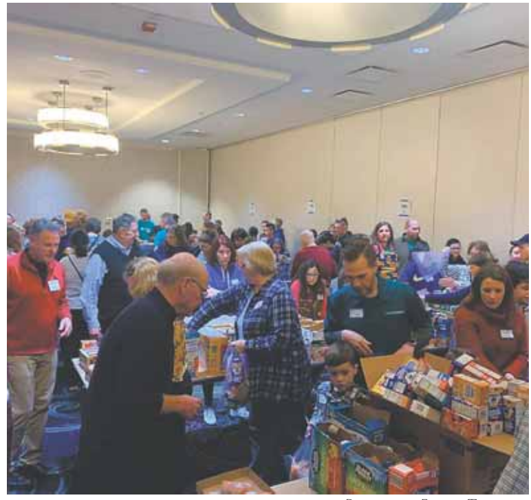
Volunteers packing bags,