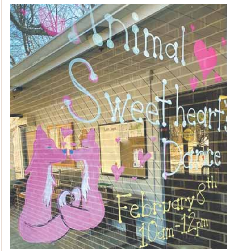
Hidden Pond Nature Center holds children's dance.