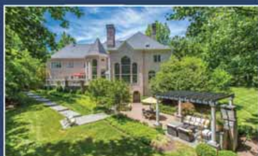
Great Falls $3,699,000