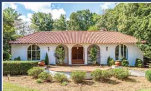
Great Falls $1,099,000