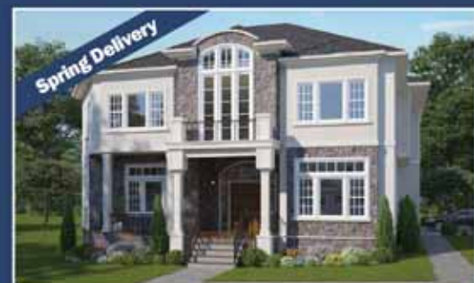
Great Falls $1,350,000