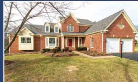
Great Falls $1,299,000