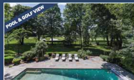
Great Falls $1,799,000