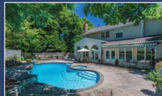
Great Falls $1,249,000