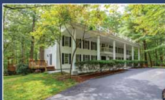
Great Falls $1,099,000