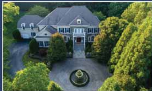
Great Falls $3,499,000

If you're buying or selling a home, think of this as a defining moment.