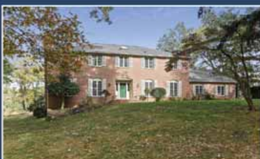
Great Falls $1,099,000