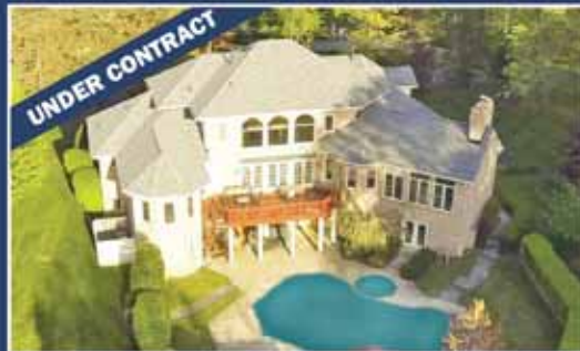
Great Falls $1,649,000