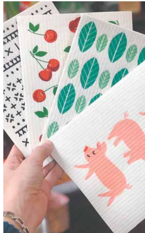
A set of Swedish towels can be a game changer for those who are environmentally conscious.

Textiles in vibrant colors like these throw pillows, can brighten the day of your Valentine.