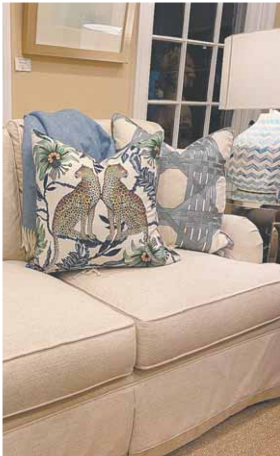
Textiles in vibrant colors like these throw pillows, can brighten the day of your Valentine.