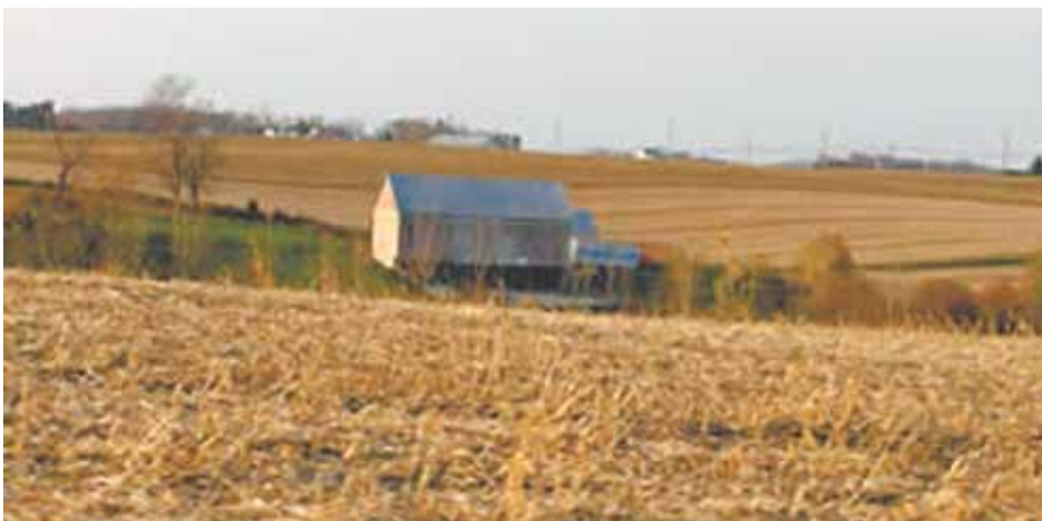
Farm views are big Rustic Road contestants.