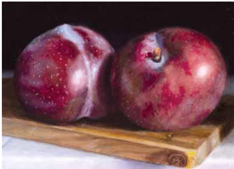
Klein plums at Artists & Makers Studio in Rockville.