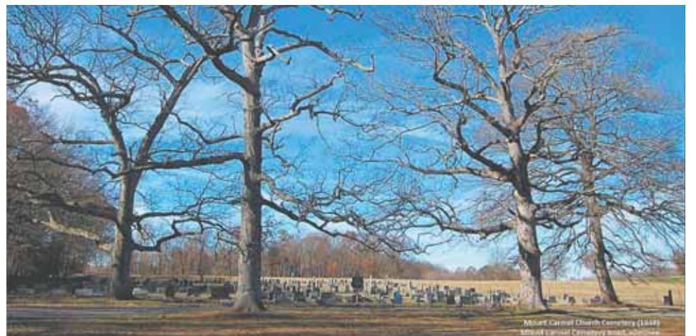
The Mount Carmel church cemetery is a nominee.