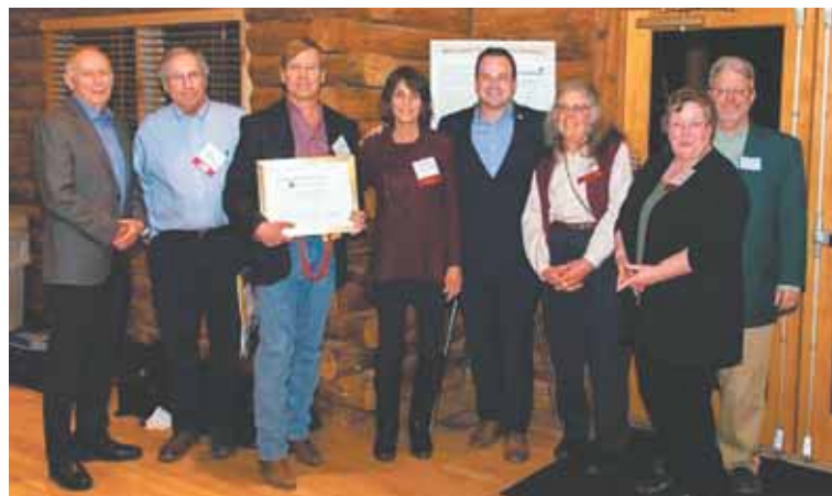
In March 2019, the Rustic Roads Advisory Committee was awarded Montgomery Preservation Inc’s Montgomery Prize in recognition of the committee’s continuous, outstanding achievement in furthering history and preservation in Montgomery County.

The next Monthly Rustic Road Meeting is 6:00 pm, February 27, 9th Floor Conference Room of the Executive Office Building, 101 Monroe Street, Rockville, MD.