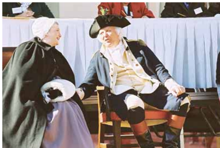
Celebrate the birthday of George Washington on Monday, Feb. 17 in Mount Vernon.

Architecture in Fiber. At Potomac Fiber Arts Gallery, Torpedo Factory,