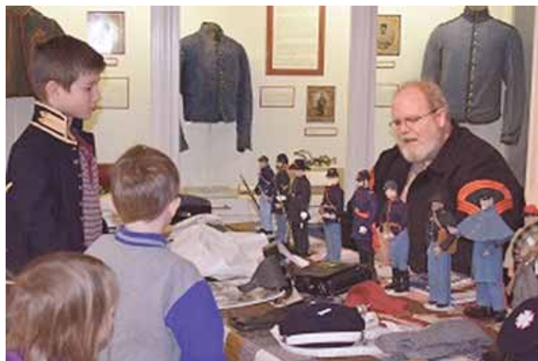
Outfitting the Men of Fort Ward will take place Feb. 22 at Fort Ward Museum in Alexandria.

Tell Me a Story Art Exhibit. March 6-29. Opening reception Friday, March 6 from 7-9 p.m. At Del Ray Artisans Gallery, 2704 Mount Vernon Ave., Alexandria. Have you ever looked at a piece of art and your imagination immediately starts to wander? Narrative art tells a story, either as a moment in an ongoing story or as a sequence of events unfolding over time. A picture is worth a thousand words; Tell Me a Story will take you on an imaginative journey. Gallery hours are: Thursdays