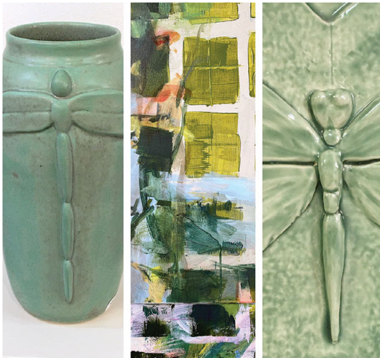
The Color Green will be on display from now thru March 29 at The Torpedo Factory Artists at Mosaic in Fairfax.