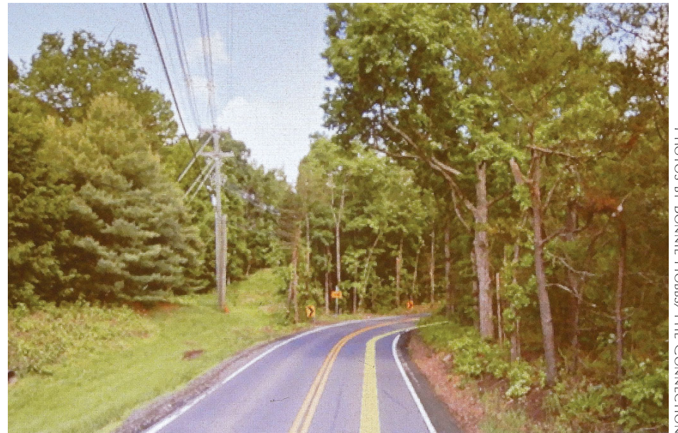
A view of the notorious, Braddock Road S curve, on the east side, looking west.