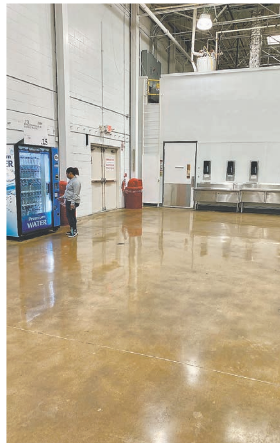
Costco eat-in dining areas removed; replaced by super clean open floor space.

Costco's were out of stock of many sought after items and employees struggled to keep shelves restocked this week. The store instituted several measures to help keep customers safe. Patrons are asked to wait in line, distanced by the length of large shopping carts, to assure the numbers inside the store at one time remain low. Every cart handle was wiped down before the customer entered. Crews inside were actively wiping and disinfecting shelves. Check out lanes have been reduced and spaced by every other register. Payment terminals no longer require touch entries or signatures (except notably at the pharmacy