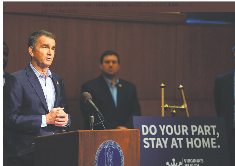
Gov. Ralph Northam, COVID-19 Briefing. March 23

AS FOR SCHOOLS, Northam said that closures were necessary to minimize the speed at which COVID-19 spread and protect the capacity of the healthcare system. Northam said, “By tomorrow, our Department of Education will issue guidance to help school divisions think through those decisions and ensure that every student is served equitably. We’re already working on waivers to relieve testing requirements and ensure that our students who were on track to graduate can do so.” He added that according to a Yale study estimate, 80,000 of students statewide may be the children of health care workers and urged a public-private response. “Today I’m calling on our