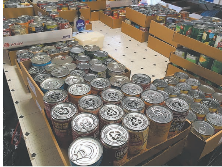
The table in the back room of Koinonia is covered with canned items.

With the coronavirus closing facilities all