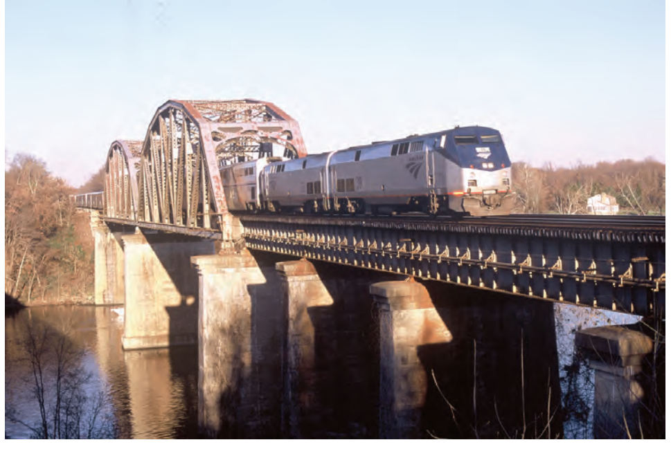
The train and car-carriers go over the Occoquan River each day.