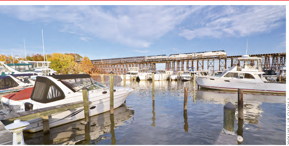
As seen from the docks on the Occoquan, the train goes by in the afternoons.

Inova is currently experiencing a shortage of blood supply, and inventory is expected to continue to drop with the shortage of donors due to COVID-19. Inova Blood Donor Services has implemented extra precautions to protect donors and assures them that it's safe to give blood and donations will save lives. Make appointments at www. inovablood.org or 800-BLOOD-SAVES.