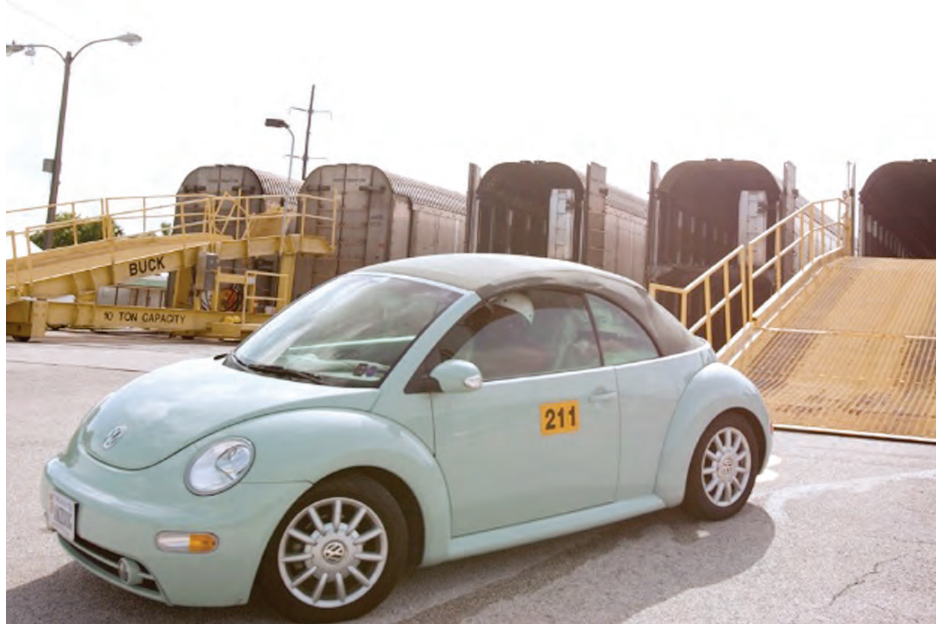
Loading and unloading the cars is just part of the whole experience.