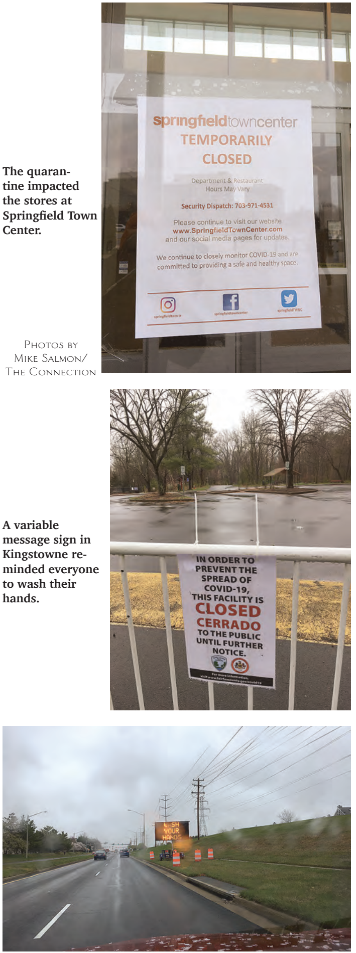
A variable message sign in Kingstowne reminded everyone to wash their hands.

Impacts from the quarantine and economic volatility are everywhere.