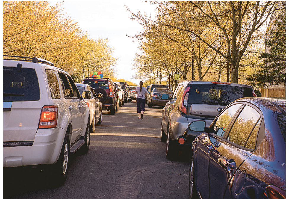
New Life Christian Church members drive by their pastor's home to show support.