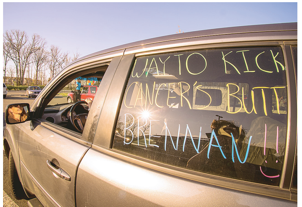
One of the encouraging messages written on a car in the procession.

He said prayer and reading his Bible have been key to keeping down his stress and anxiety. In addition, he's made two, separate, to-do lists nearly every day. One is for things he'd like to accomplish, such as work