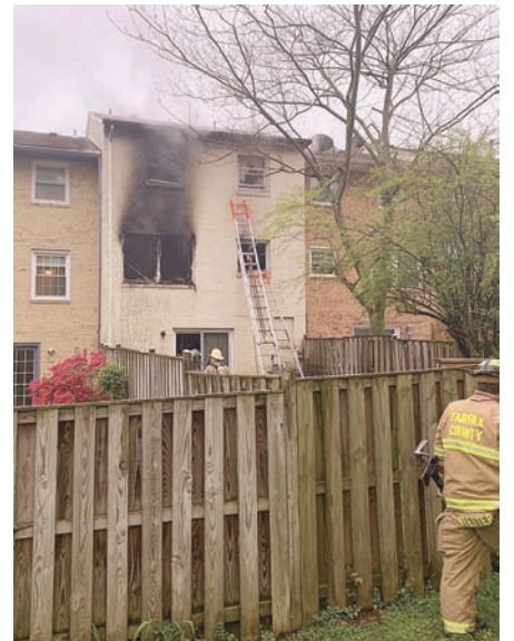
A woman died after a fire in her Centreville townhouse.

First-arriving units saw visible fire coming from the middle unit of the two-story townhouse, with flames extending from the first to the second floor. A second alarm was struck, and firefighters quickly brought the blaze under control. Meanwhile, the female occupant was found and rescued and then flown by helicopter to the hospital, where she later succumbed to her injuries. An autopsy will determine her identity and exact cause of death.