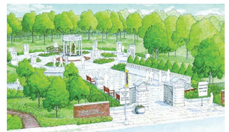
Architect's rendering illustrates Turning Point Suffragist Memorial plan before cost cutting changes.