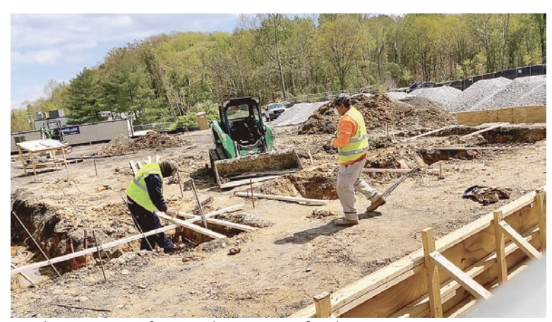
Workers prepare for pouring cement footings.