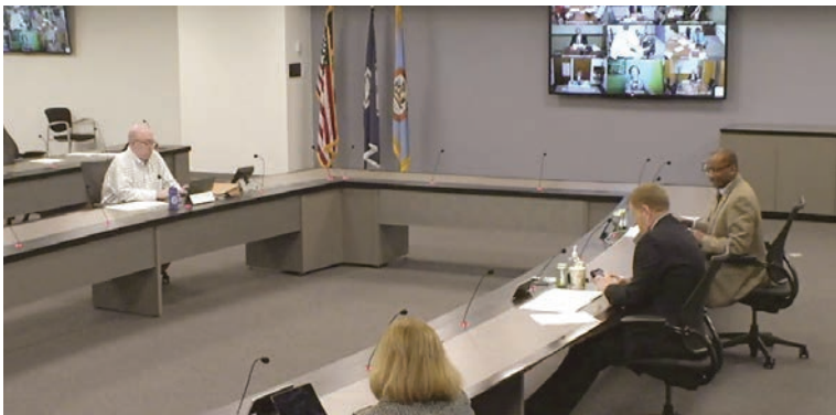
Fairfax County Board of Supervisors and staff meet socially distanced and remotely for the Wednesday, April 29 public hearing on the revised fiscal year (FY) 2021 budget proposal before them.