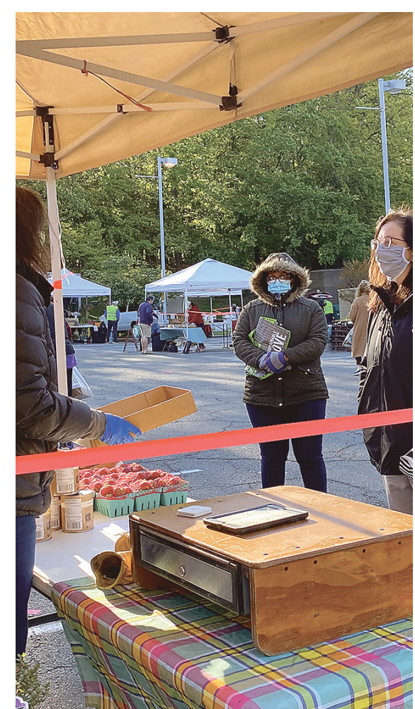
Masked shoppers and vendors maintain social distance on Opening Day of the 2020 Reston Farmers Market.