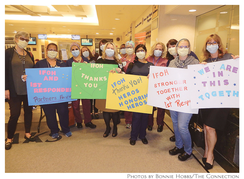
Inova Fair Oaks nurses display signs thanking fire and police personnel for their support.