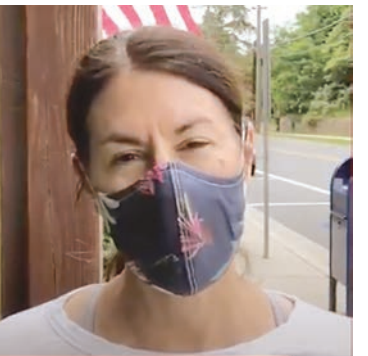
Vienna Mayor Laurie DiRocco:

According to Executive Order 63 (2020): "Individuals who contract the virus may still transmit the virus to others before ever showing symptoms. Therefore, a