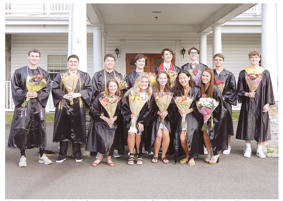
The 13 graduates gather for a group photo before the parade in Centreville.