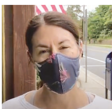
"I wear a mask because I want to protect the citizens of my community."