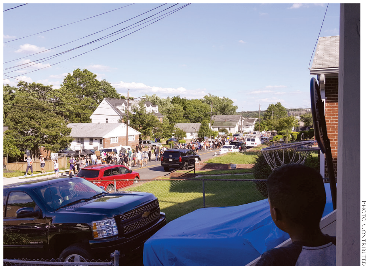
Protest banners appear mid-week obscuring the Nauck Community sign in Nauck/Green Valley, the historically African-American part of Arlington established in 1844. On Sunday protesters marched peacefully from Green Valley to Walter Reed where police joined the group and led them to Johnson Hill and back to Green Valley.