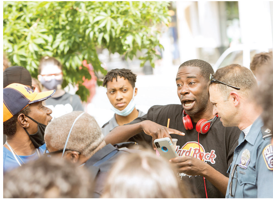
Protesters engaged with officers.