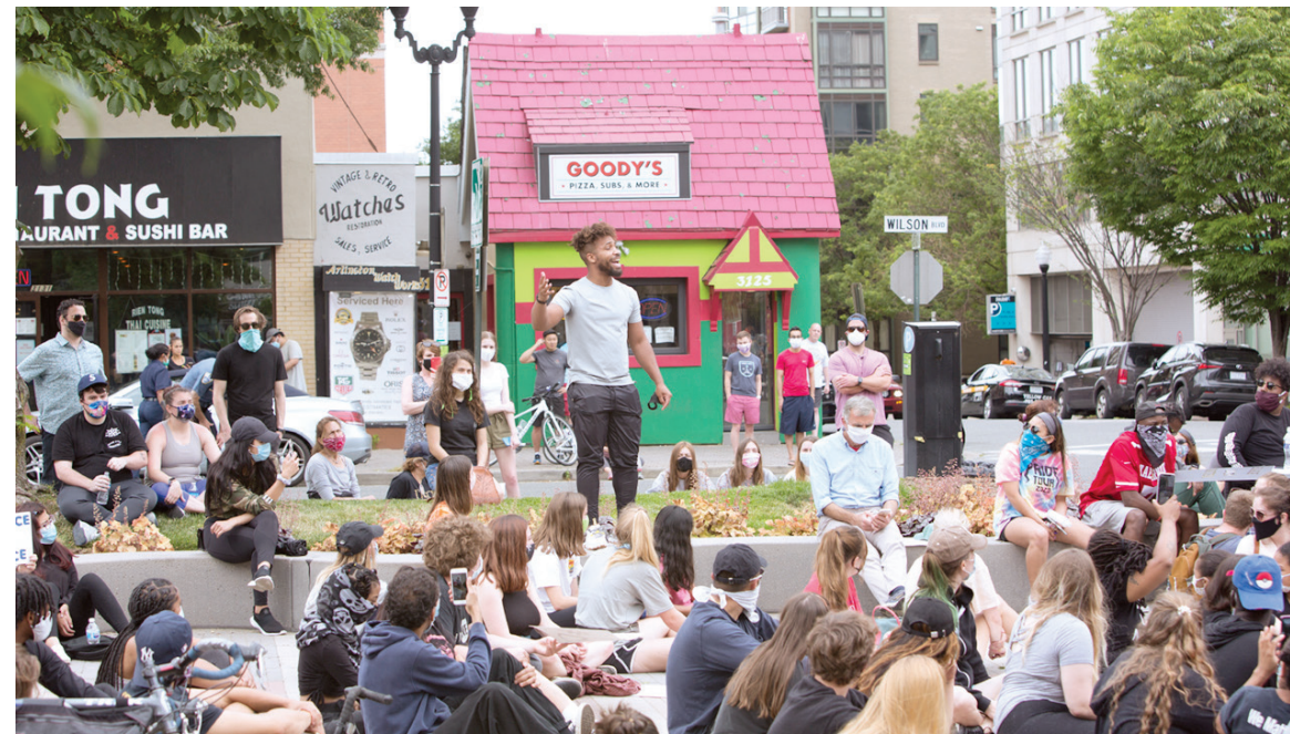
"What can we do? When we talk to [our] kids, don't say this happened because the person is black. That will make them feel powerless. They can't change the color of their skin. Say it's because of racial bias. We can change racial inequality."