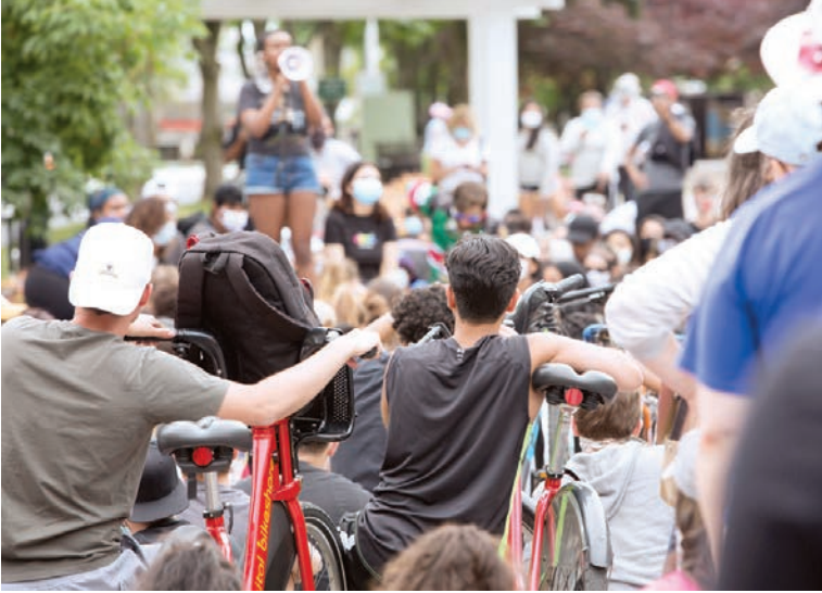
"If you aren't joining us, you are the enemy too."