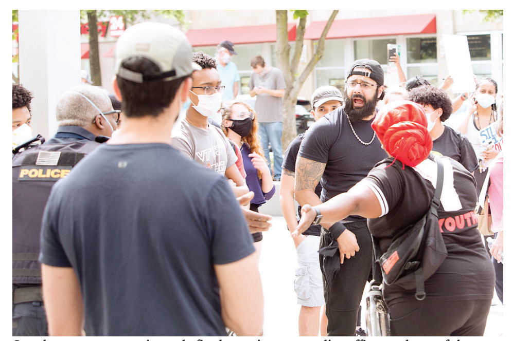
One demonstrator passionately fired questions at a police officer and one of the speakers got between them, suggesting the man listen to what the police officer had to say. And he did.