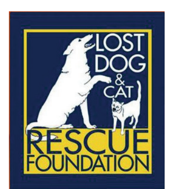
Helping Animals Find Their Way Since 2001

lost (adj): 1. unable to find the way. 2. not appreciated or understood. 3. no longer owned or known