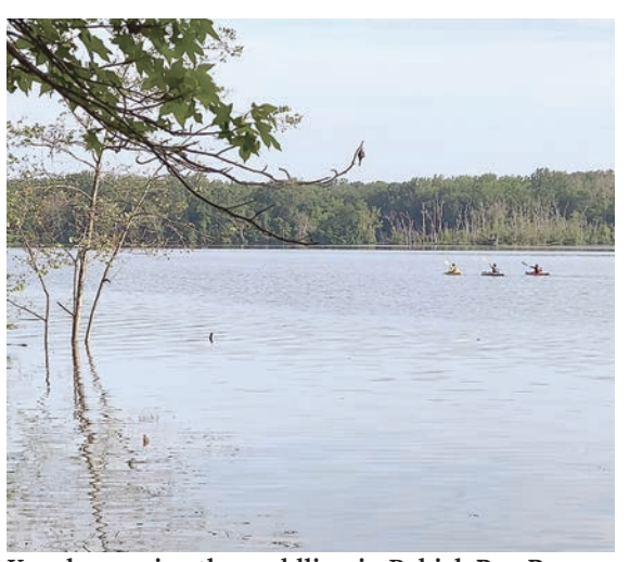
Kayakers enjoy the paddling in Pohick Bay Regional Park.

Run Regional, park land continues through Hemlock, Fountainhead and Sandy Run, a scholastic rowing facility, for a 20 mile, 4,000 acre block of parkland. After a gap with the Vulcan Quarry, Fairfax County Water, and a few private residences, the Occoquan Regional Park begins, running along the river shoreline. NOVA Parks notes that park usage has increased substantially since the pandemic as citizens seek exercise and relief in the park system's natural settings.