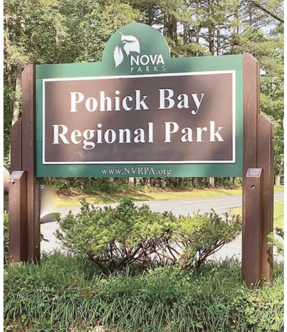
Pohick Bay Park acquires land for conservation.

The Regional Park system on the southern border of Fairfax County encompasses approximately 34 miles of nearly contiguous parkland. Beginning at Bull