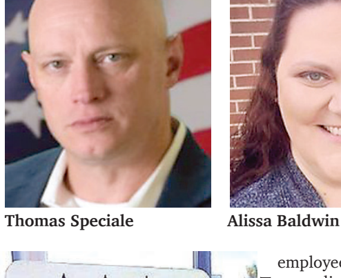
The Republican primary is June 23. The deadline to submit an application for an absentee ballot is June 16.

"Right now all they have to do is report their transactions, which is how we knew about the fire sale of stocks," he said. "It ba-