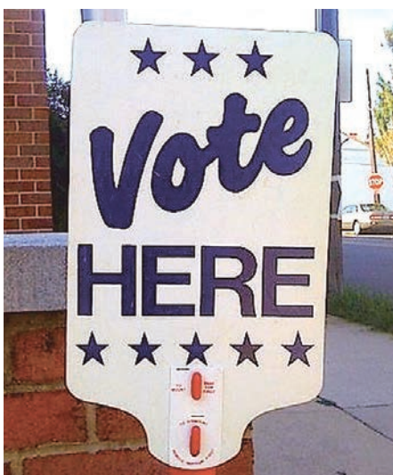
The Republican primary is June 23. The deadline to submit an application for an absentee ballot is June 16.

"Right now all they have to do is report their transactions, which is how we knew about the fire sale of stocks," he said. "It ba-