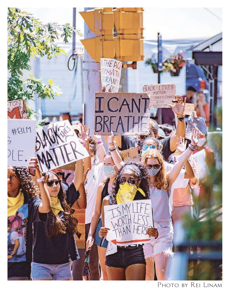
Leaders of Change Coalition, students from South Lakes and Oakton high schools, hold a Black Lives Matter March in the Town of Herndon.