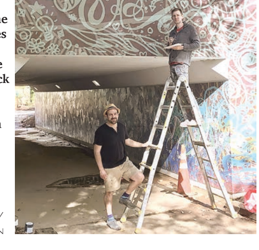
Reston Mural Judged Among Top 100 Globally