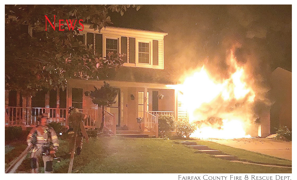
Flames are pouring out of this Franklin Farm garage.