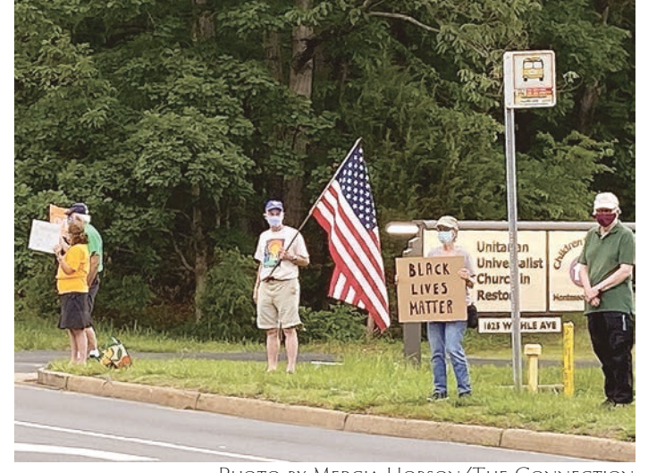
On June 5, a week before the theft of the newly installed Black Lives Matter banner, church members and others stand in solidarity during a silent vigil to show their support that police brutality and killings of Black people must end.