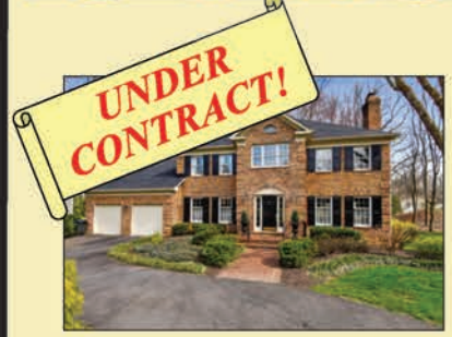
5904 Moss Wood Lane McLean, 22101 $1,499,999