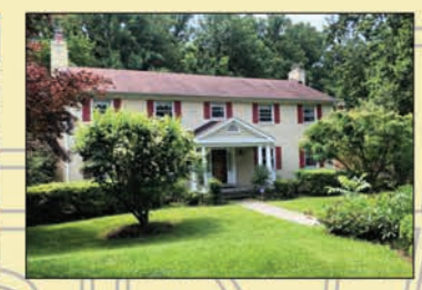
McLean, 22101 RENTAL - $4900/month

Call to sign up for a virtual 1-on-1 appointment with JD today!