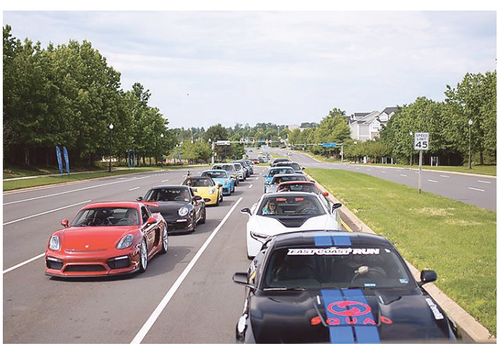
Cars along a small section of the over 100-mile-cruise en route. Organizers started planning the car cruise in April and — Tommy Zavrel of Great Falls garnered about 200 donations.

"We just wanted a way to bring the community together and we wanted to help out the nurses."