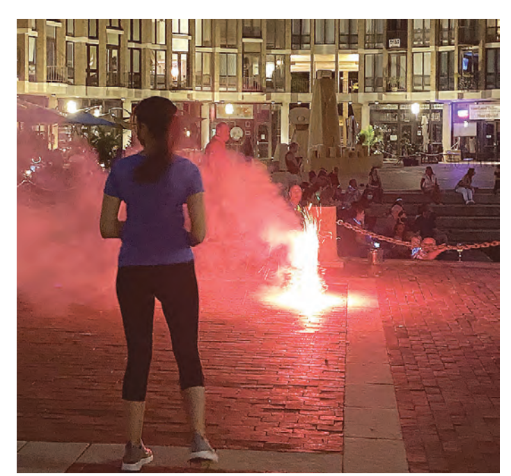
A fountain firework colors Lake Anne.