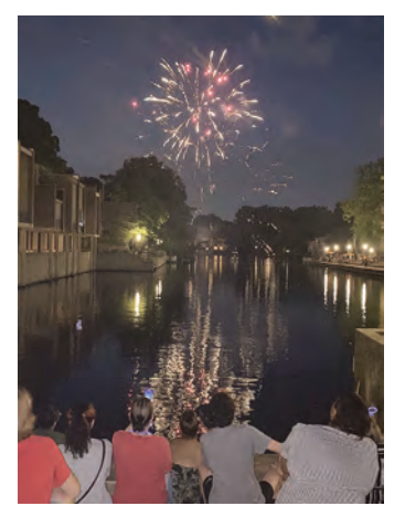
Fireworks erupt in a brilliant display over Lake Anne in Reston the evening of the 4th of July 2020. Individuals set off the unadvertised show from private boats floating in the reservoir.

A few minutes after 9 p.m, the first aerial firework whistled, and the sky lit up. For the next 30 minutes, Lake Anne in Reston returned to normal.