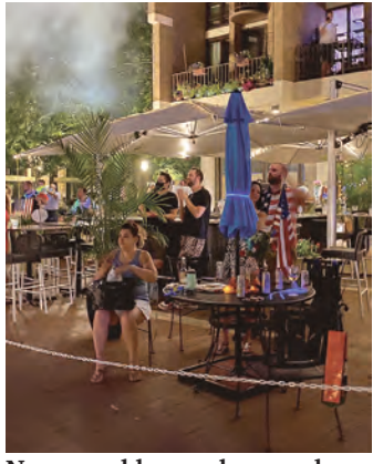
Neon necklaces glow, and everyone, waitstaff and diners at Kalypso's Sports Tavern at Lake Anne in Reston, pauses a moment to watch the fireworks illuminate the night sky over the reservoir on Independence Day 2020.