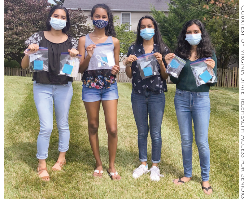
Northern Virginia college students collect and sanitize handheld devices to help seniors stay connected to health care providers, family and friends.

"We're also collecting money 8 • Oak Hill/Herndon / Reston