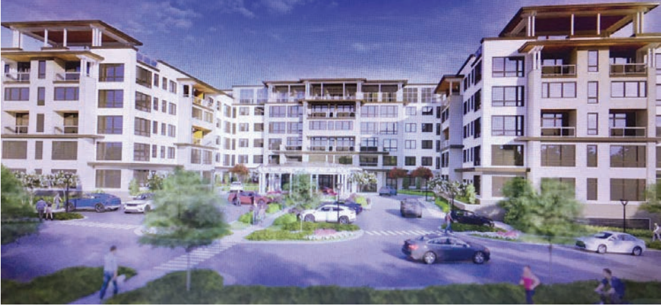
Artist's rendition of the multifamily building proposed for Boulevards at Westfields.

"We're putting people's lives at risk by this www.ConnectionNewspapers.com