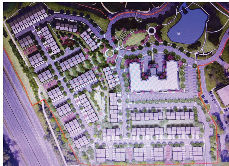
Site plan of the 442 homes proposed for construction by developer K. Hovnanian.