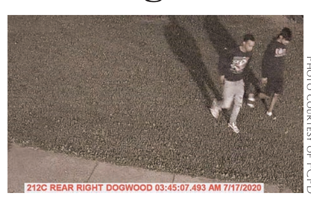
Detectives have released the images that depict persons of interest.

etectives from Major Crimes Bureau are asking for the public's help as they continue to investigate after two men were found with stab wounds July 17 around 3:41 a.m. in the 12200 block of Laurel Glade Court. Both men were taken to a hospital. One of the men sustained injuries that were initially considered life-threatening; his condition was