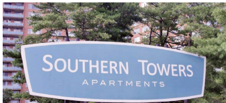
Southern Towers Apartments, site of a number of eviction cases.

state and local financial assistance for rent and mortgage relief. Alexandria has allocated $4 million from this fund to this massive city-