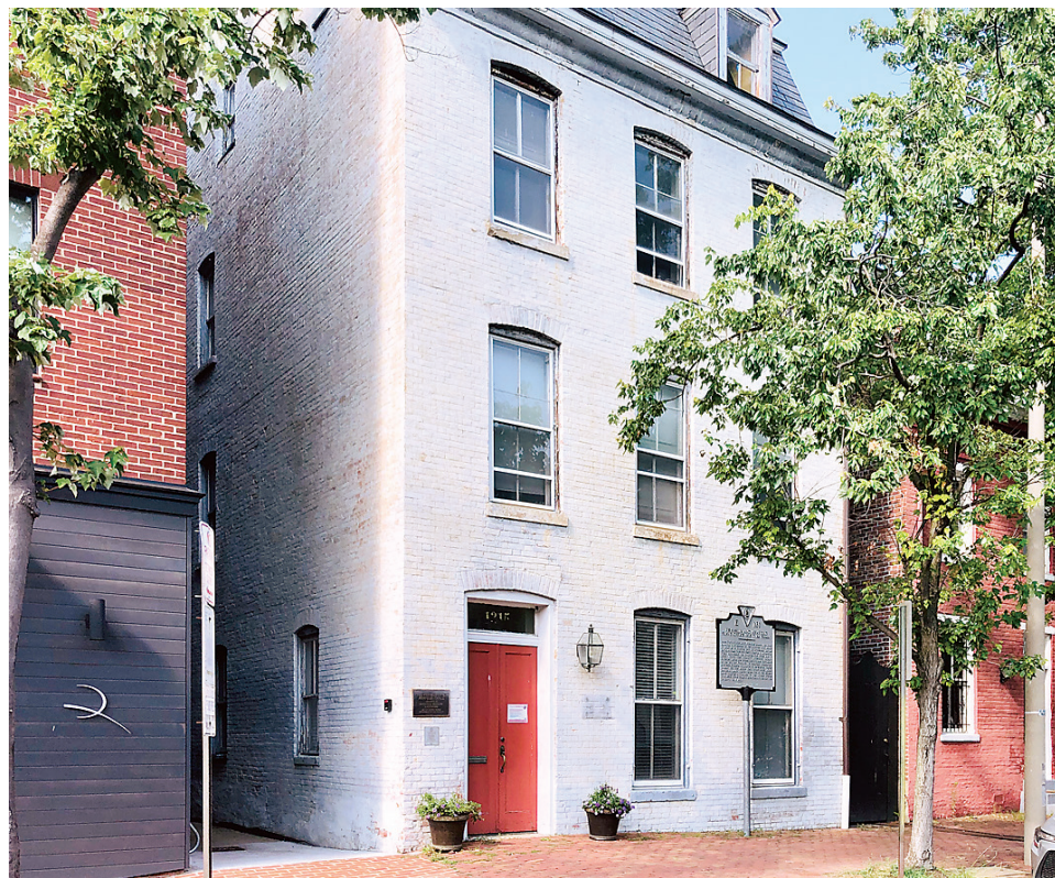
Before the pandemic, Alexandria was to receive $2.5 million to help renovate the old Franklin and Armfield slave-trading office into the Freedom House Museum. Now that money is in doubt.

Public-school teachers might not end up with the 2 percent raise they were promised before the pandemic. Colleges and universities might not get money that was earmarked to help keep tuition from increasing. Local governments might not get money for affordable housing programs, and a series of water-quality improvement projects might be on the chopping block. Lawmakers are hoping Uncle Sam will bail them out.