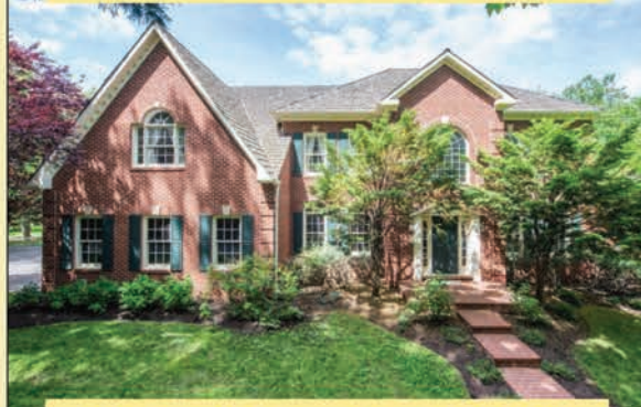
Offered for ... $1,499,000