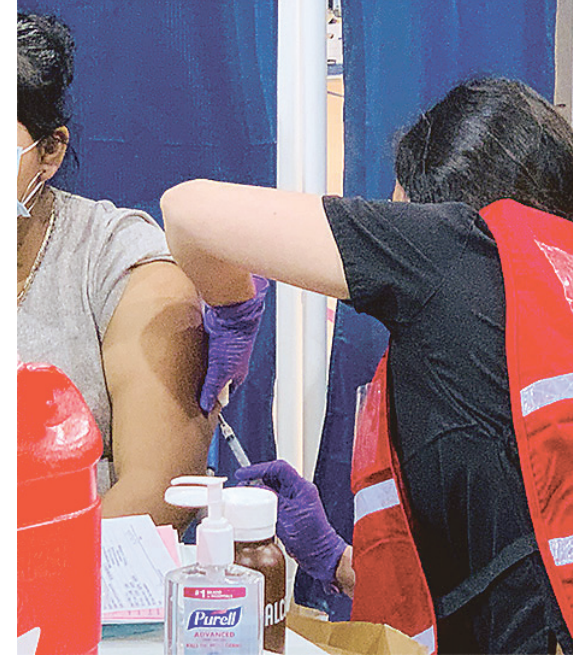
Even though the start of the school year will mean distance learning at home this year, children are still required to be vaccinated to enroll.