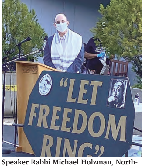
ern Virginia Hebrew Congregation.