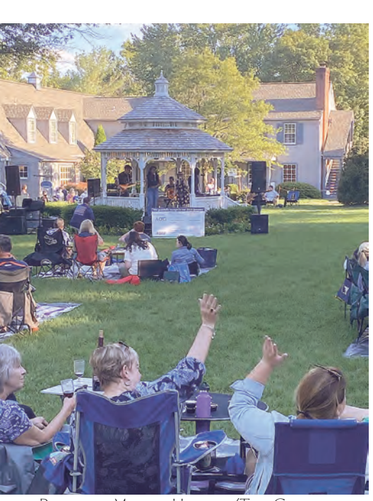
Friends sends their hellos by waves keeping their social distance during opening night for Concerts on the Green in Great Falls. held Sunday evening Aug. 30.

CodeWizardsHQ is offering online after school coding classes for kids and summer coding classes for kids with a structured curriculum that is comprehensive, developmental, challenging, and fun. Students get to code a project in every class. Expect the most fun