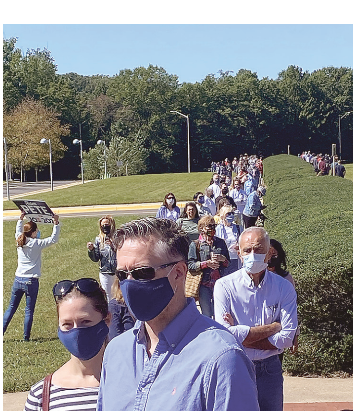
Line of voters at Fairfax County Government Center on the third day of early voting