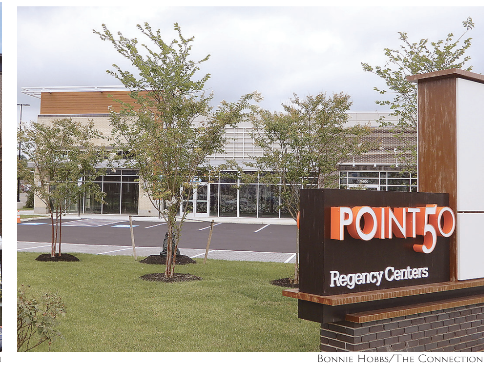
Some of Scout on the Circle's apartments along Fairfax Boulevard.

Point 50 is the new name for the revitalized Fairfax Shopping Center.