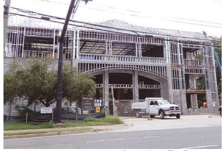
Construction of the new Fire Station 33 is progressing well.

6 & Burke / Fairfax / Fairfax Station/Clifton/Lorton / Springfield & October 1-7, 2020