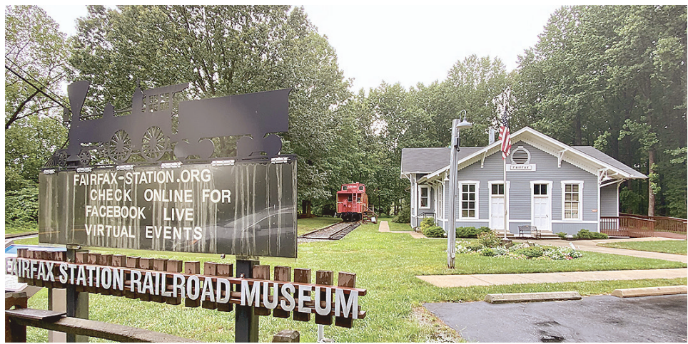
Railroad Museum (11200 Fairfax Station Rd, Fairfax Station). Once part of the Orange and Alexandria (O&A) Railroad moving farm products to the city between Lynchburg and Alexandria.

2020 Newcomers & Community Guide 2020-21 & www.ConnectionNewspapers.com