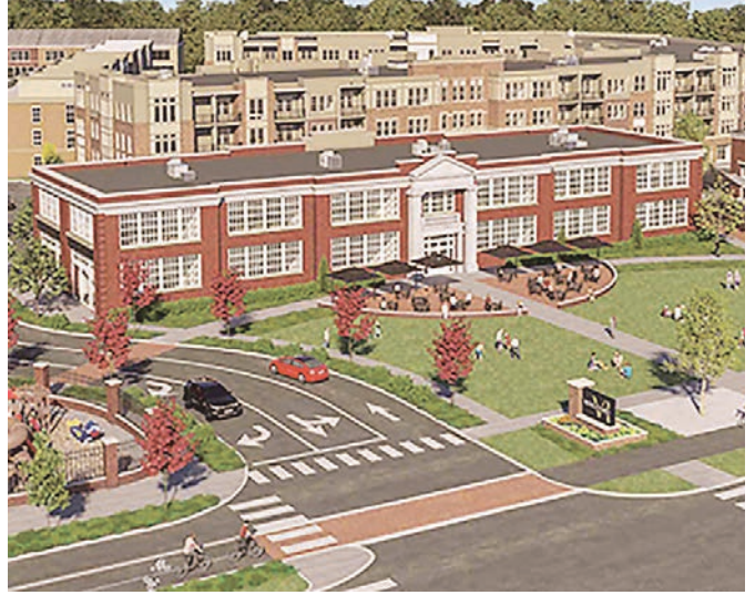
Artist's rendition of the Boulevard VI project, on Paul VI High's former site.

Newcomers & Community Guide 2020-21 ♦ www.ConnectionNewspapers.com