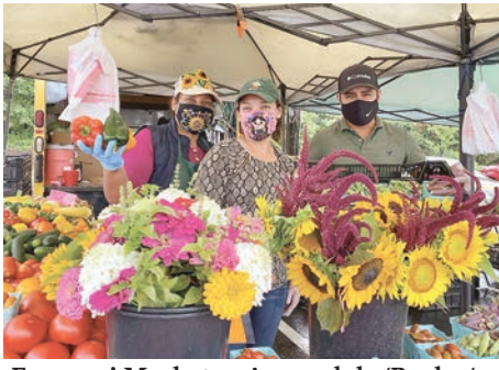
Farmers' Markets - Annandale/Burke/ Lorton (8100 Braddock Rd, Annandale/ 5671 Roberts Pkwy,Burke/ 8990 Lorton Station Rd, Lorton).