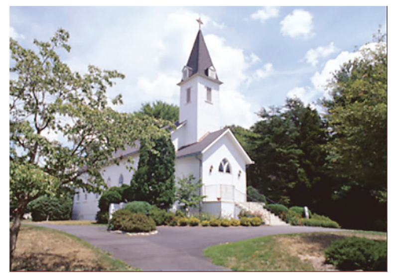
A piece of local history: Wakefield Chapel