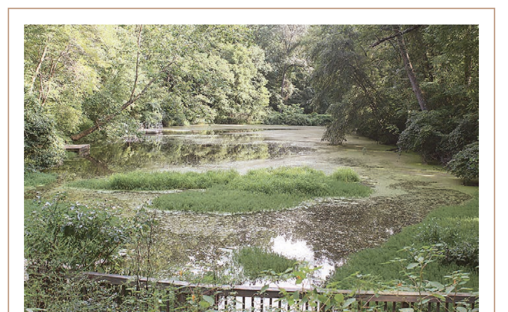
Hidden Pond Nature Center: Acres of undisturbed woodland, quiet trails, splashing streams and a tranquil pond.