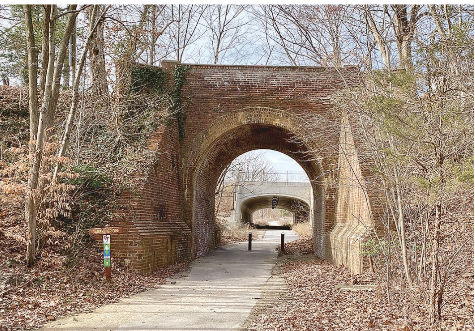
Barrel Bridge (Laurel Hill Park 8780 Lorton Rd, Lorton). Historic brick and masonry arched bridge built in 1946, outlines a new bridge (background) which replaced it for vehicular traffic.