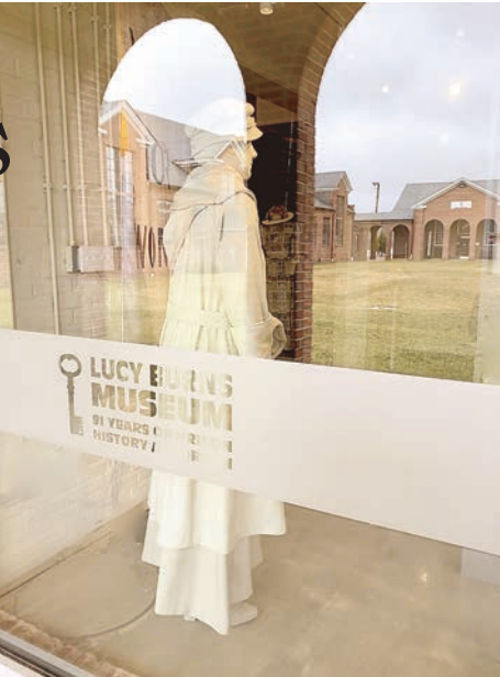
Lucy Burns Museum (9518 Workhouse Way, Lorton).