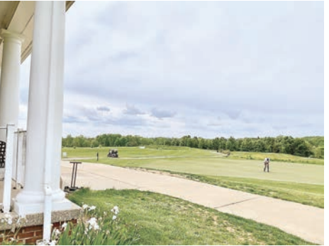
Laurel Hill Golf Club/Giles Run Disc Golf Course (8701 Laurel Crest Dr / 8409 Lorton Rd, Lorton).