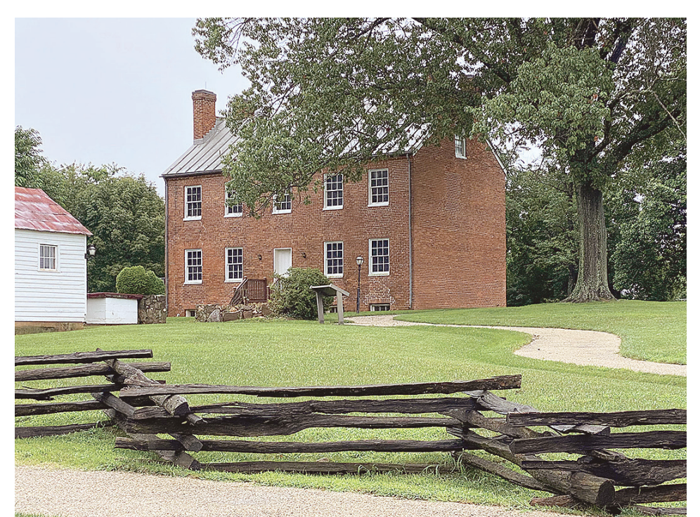
Historic Blenheim (3610 Old Lee Hwy, Fairfax). This brick farmhouse in Greek Revival style and its property became an encampment for Union soldiers during the American Civil War; the house was used as part of a reserve Union hospital system. The house, and the Civil War Interpretive Center next door, are part of the Northern VA Civil War Graffiti Trail, providing a unique glimpse of Union and Confederate soldiers as their armies swept through the area leaving written messages behind. 12 Surke / FAIRFAX / FAIRFAX STATION/CLIFTON/LORTON / SPRINGFIELD SOCTOBER 1-7.