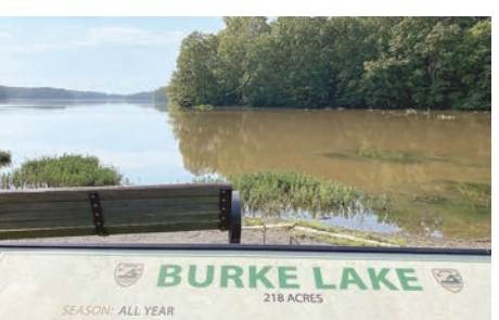
Burke Lake Park (7315 Ox Rd, Fairfax Station). Park encompasses 888 acres, with a 218 acre freshwater reservoir, and 4.7 mile hiking trail.