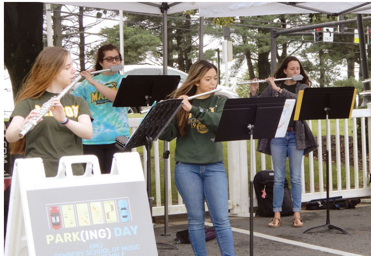
GMU flute players performing for Parking Day attendees.

Fairfax City recently held its second annual Park(ing) Day, turning a Fair City Mall parking lot into a space for outdoor fun.