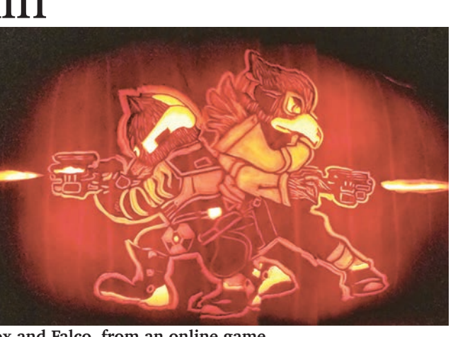
Fox and Falco, from an online game