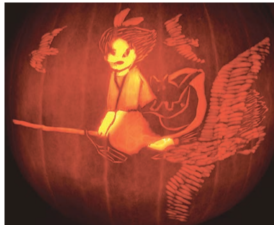
Kiki's Delivery Service