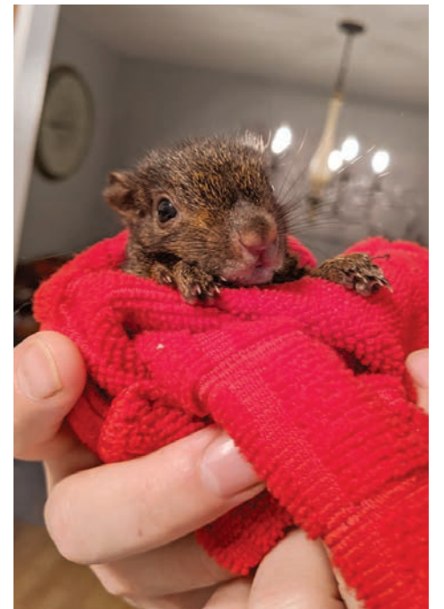
Milkdud the squirrel was rescued by the AWLA and taken to a wildlife rehabilitator for help.