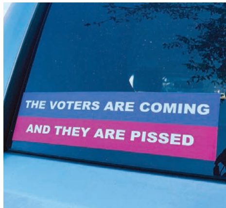
Elections are often driven by bumper-sticker politics and driveway moments.