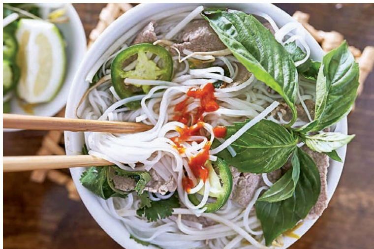
Several varieties of pho are on Hangry Panda's food truck menu.