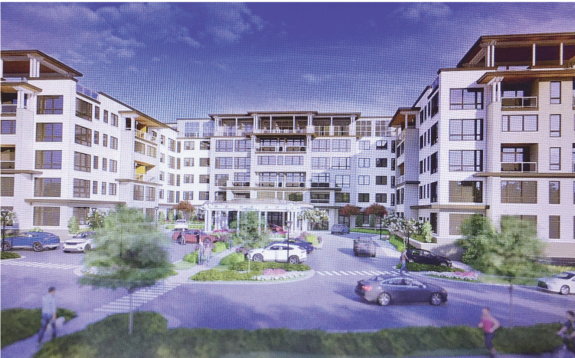
Artist's rendition of part of the Boulevards at Westfields in Chantilly.