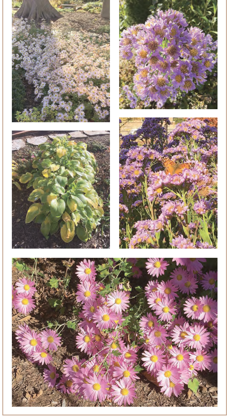
8 🚸 Burke / Fairfax / Fairfax Station/Clifton/Lorton / Springfield 💠 November 26 - December 2, 2020