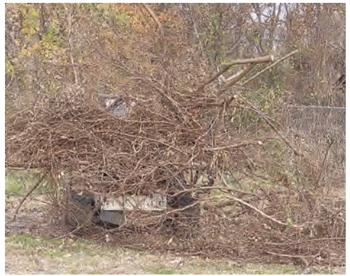
Volunteers gathered invasive vine pulled from fencing and trees into debris piles large enough to obscure bobcat equipment.