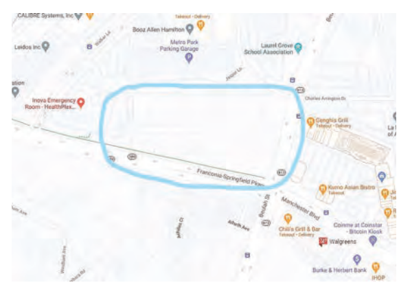
Circled here is the 21-acre site that Inova recently purchased.

The Healthplex facility, which is a few hundred yards away from the site, "will continue serving the community through the development of this project," www.ConnectionNewspapers.com