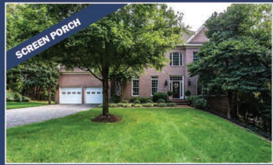
Great Falls $1,585,000