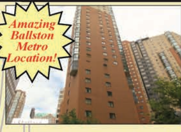
900 N. Stafford Street Arlington, 22203 $619,900