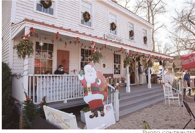
Town of Vienna is sharing a handful of ho-ho-holiday activities for all ages.

To sign up, go to viennava. gov/registration and put in ac-