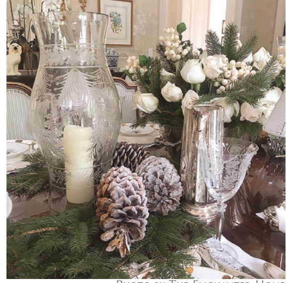
Etched hurricanes mixed with greenery and pinecones create an elegant tablescape.

"Votive candles add understated elegance and are a must have for any holiday table," she continued. "There nothing like the glow of candlelight [mixed] with greenery is always a beautiful look and I will often add faux white berries for a little something extra."