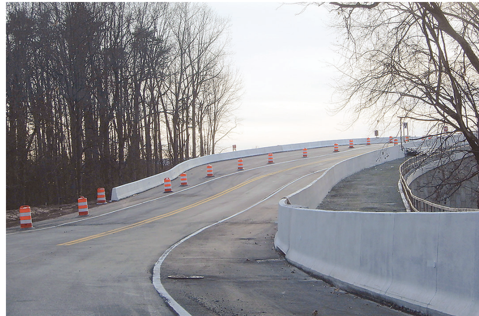
The brand-new ramp from Chantilly's Walney Road/Cabells Mill Drive intersection over Route 28.