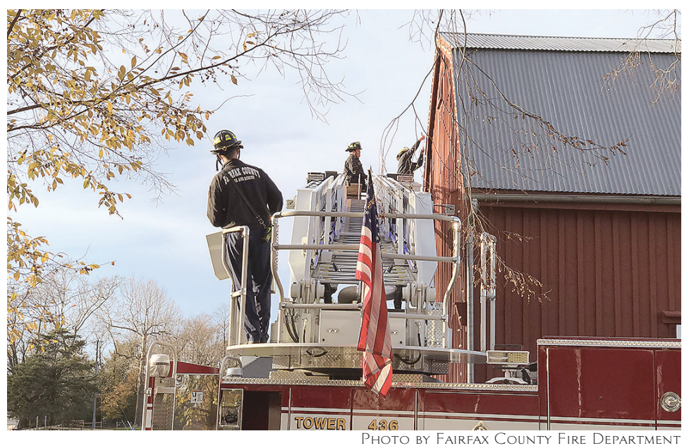
Staff at Fairfax County Fire Station 36 - Frying Pan Park get ladder truck training as they decorate the Park Authority's barn at Frying Pan Farm Park.

agreed. "Burke Lake had their event for five years. It's pretty much plug and play. So, we took everything from Burke Lake, moved it over here and figured out where it would go best.'