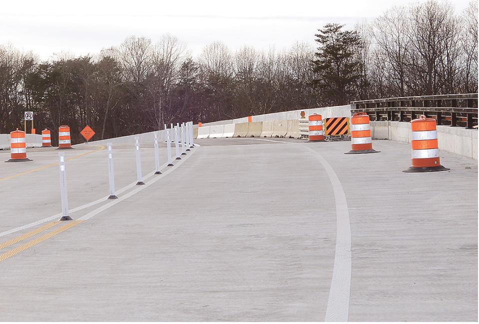
This is the new Route 28 overpass, connecting people from Chantilly directly to Centreville.