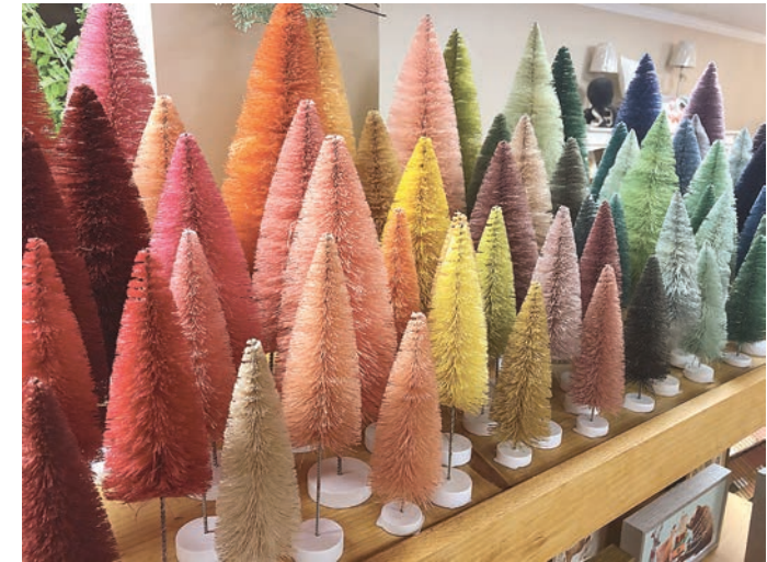
Tiny Christmas trees made from bottle brushes add a splash of color to holiday décor.