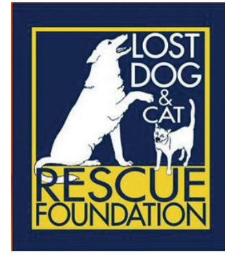
Helping Animals Find Their Way Since 2001

Volunteers needed for adoption events, fostering, transportation, adoption center caretaking and more.