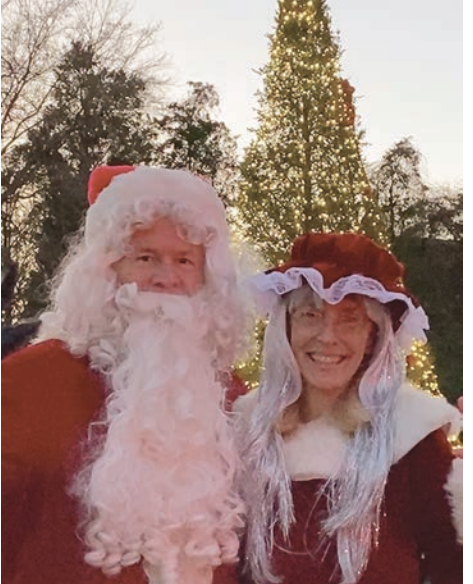
Santa and Mrs. Claus turn around to face their elves after lighting the tree.

The children didn't seem to miss the addons from previous years. No pony rides: no petting zoo. They were at the Village Centre to see the man dressed in a red suit and talk with him. Santa took his time and answered the children's questions called out through car windows. "I like chocolate chip cookies," Santa said many times. Seated beside Mrs. Claus in the bed of a pickup truck, Santa posed perfectly for families to take photos www.ConnectionNewspapers.com