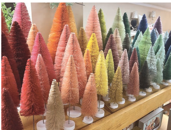
Tiny Christmas trees made from bottle brushes add a splash of color to holiday décor.

Etched hurricanes mixed with greenery and pinecones create an elegant tablescape.