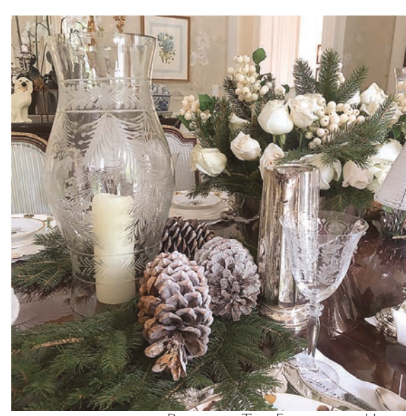
Etched hurricanes mixed with greenery and pinecones create an elegant tablescape.