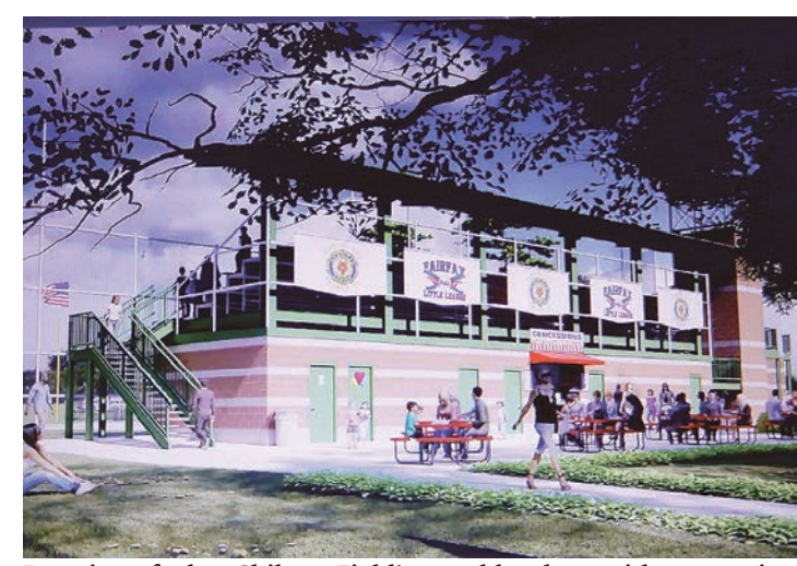
Drawing of what Chilcott Field's new bleachers with concession stands, restrooms and elevator (at far right).