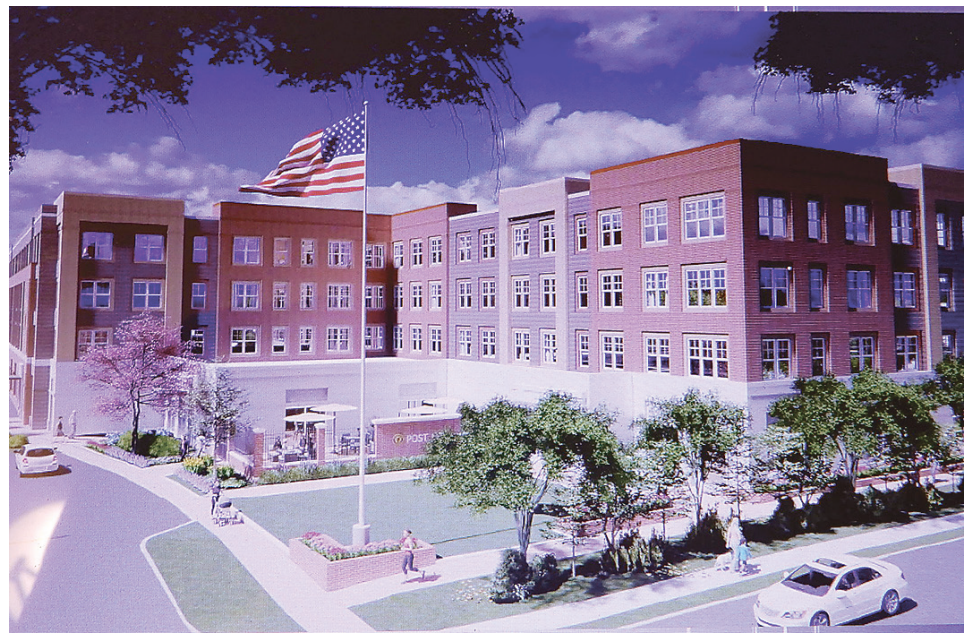
Artist's rendition of the American Legion post in front (white exterior) and the affordable apartments above.