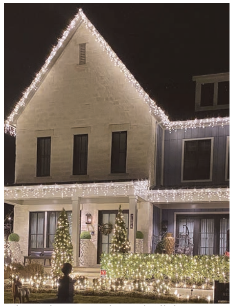
A home in McLean keeps its lights up in January.