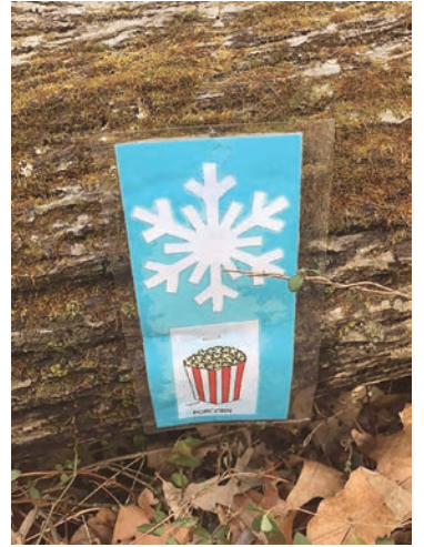
One of the many clues along the Snowflake Trail.

Visitors scan QR codes with a smartphone to learn the gifts the animals are receiving. Snowflake