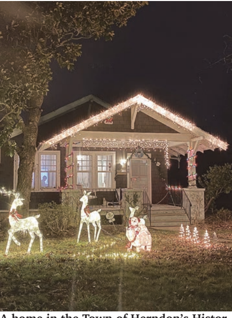
A home in the Town of Herndon's Historic District keeps its lights up in January.

THE WEEKEND after New Year's, homes in McLean, Great Falls, Vienna, Reston, Herndon, and beyond appeared to have kept their holiday lights up. "We want healthcare heroes...to see the support and gratitude from our communities and our colleagues. As they drive to or from their shift, the holiday lights will express