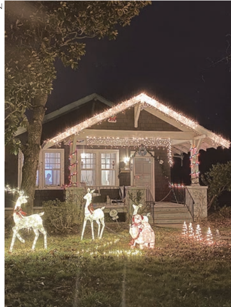
A home in the Town of Herndon's Historic District keeps its lights up in January.

THE WEEKEND after New Year's, homes in McLean, Great Falls, Vienna, Reston, Herndon, and beyond appeared to have kept their holiday lights up. "We want healthcare heroes...to see the support and gratitude from our communities and our colleagues. As they drive to or from their shift, the holiday lights will express