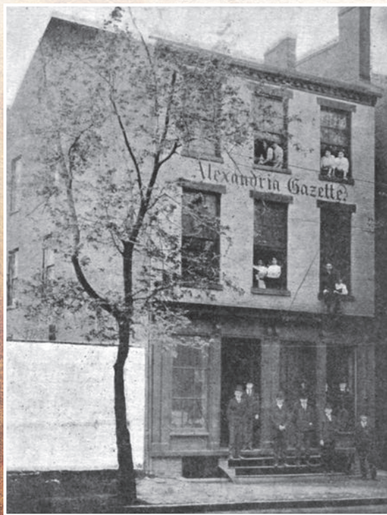
Pictured: One of the several historical buildings that has housed the Alexandria Gazette Packet since its 1784 founding.

Mount Vernon Gazette Potomac ALMANAC Centre View