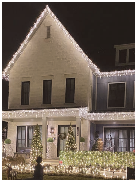
A home in McLean keeps its lights up in January.