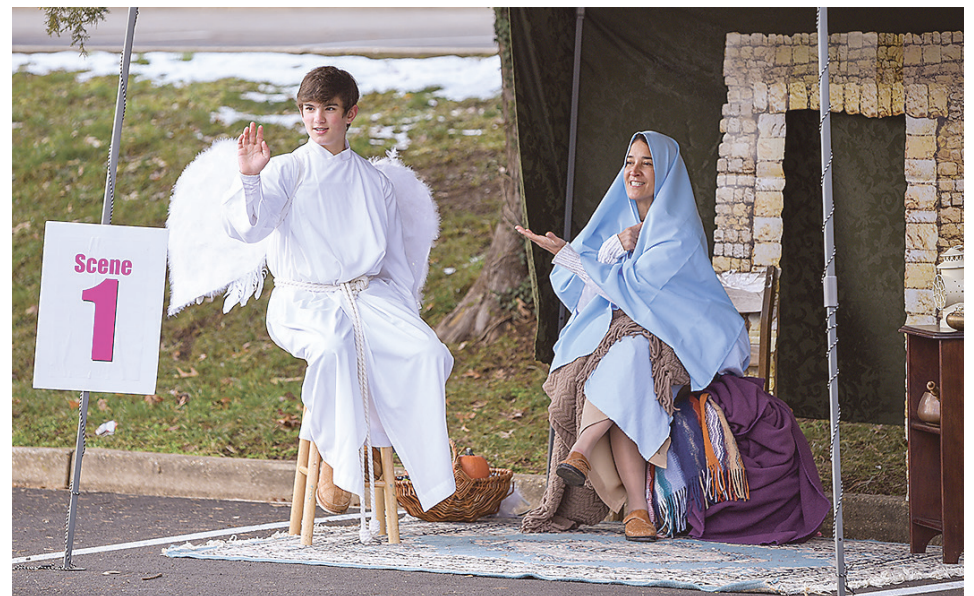
The angel Gabriel visits Mary to tell her she will soon be with child.