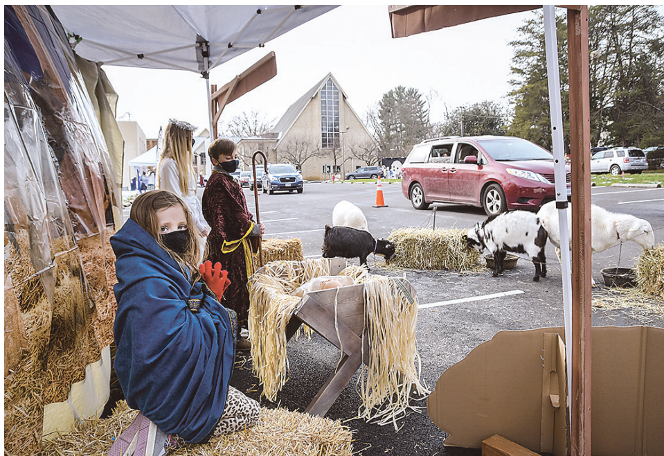
The nativity scene with Mary, Joseph, baby Jesus in the manger, the three wise men, an angel and the animals.

dreams and works. The staff of The Alden Theatre, a division of the McLean Community Center, produced and is overseeing the compelling social justice and community building events.