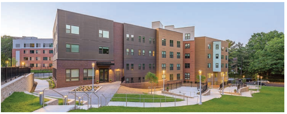
St. James Plaza also includes a 2,300-square-foot preschool for 50 children operated by nonprofit The Campagna Center.

Based in Arlington, AHC has developed more than 7,500 apartment units in 50+ properties in Virginia, Maryland and Washington, D.C. AHC's Resident Services program reaches 3,000 children, teens, adults and seniors each year through on-site education and social service programs and activities. For more information, visit https:// www.ahcinc.org/.