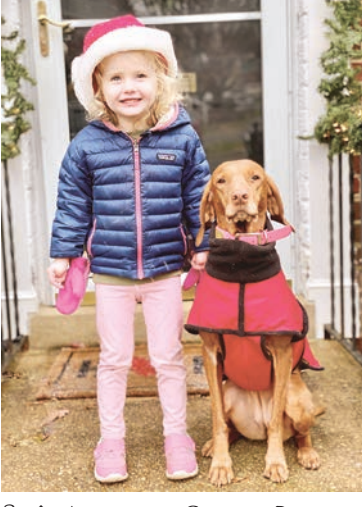
8 🏼 Alexandria Gazette Packet 🔹 January 7-13, 2021