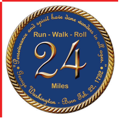
Participants in the American Legion's 24-mile Run, Walk & Roll virtual challenge will receive a custom-designed commemorative coin.