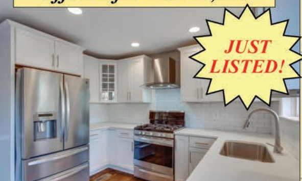
Fabulous Alexandria Townhome!