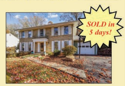
1933 Freedom Lane Falls Church, 22043 $1,049,000

1469 Waggaman Circle McLean, 22101 $1,999,000 or $6900/month