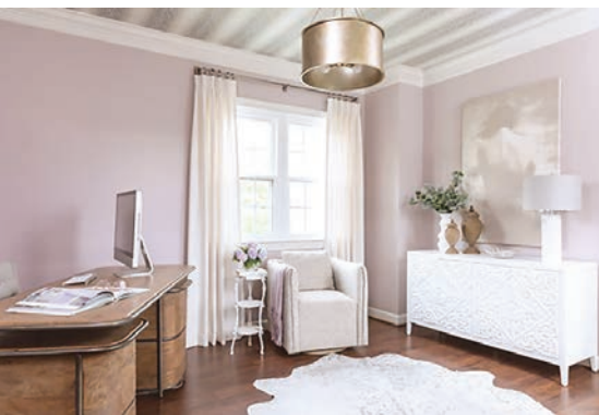
Shades of lavender and white can create a serene and soothing aesthetic.

whites, and soft textures, such as those used in her custom drapes. This room worked so well that she often finds her children in her space relaxing."