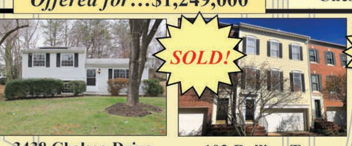
3438 Chelsea Drive Woodbridge, 22192 $374,900