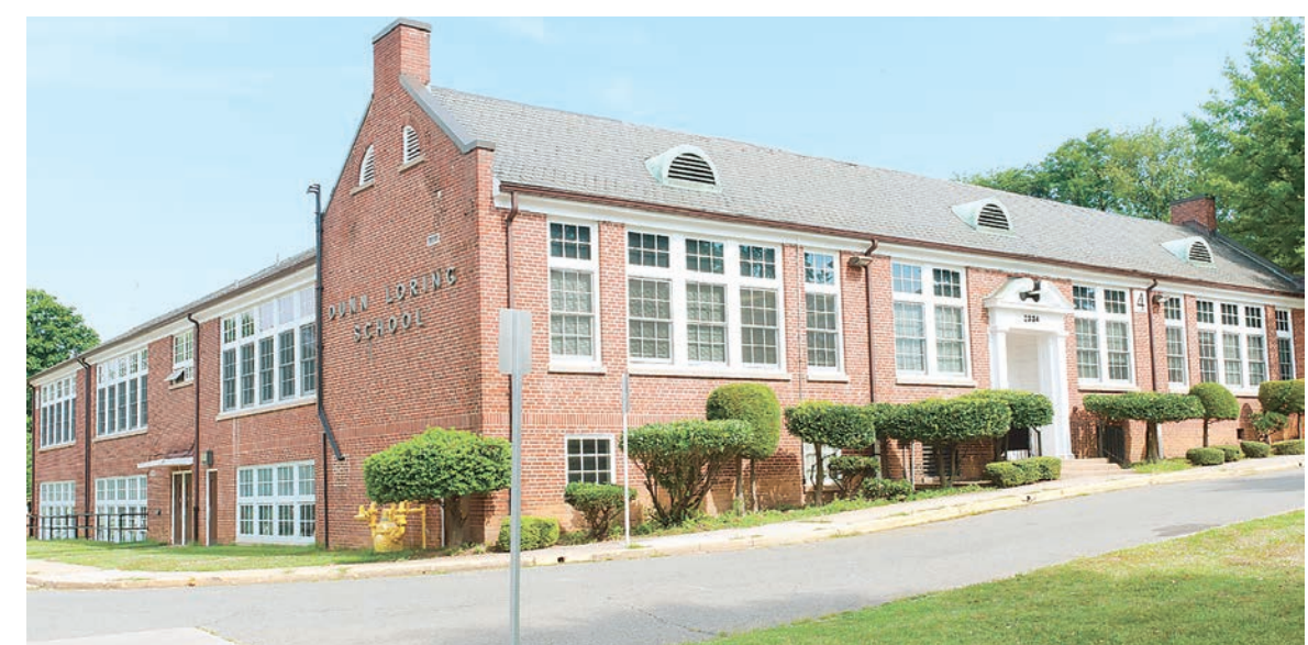
The Fairfax County School Board approved repurposing of Dunn Loring Administrative Center as a new elementary school providing capacity relief at Shrevewood Elementary School in Falls Church and the Dunn Loring, Tysons, and Falls Church communities.

According to FCSB documents, in 2017 and 2019, voters approved bond funds