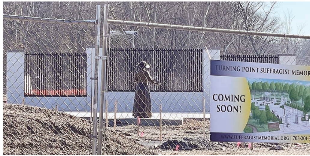
Site of the Turning Point Suffragist Memorial under construction with expected completion in Spring 2021.

Replicas of the White House gates and fence form the entrance to the Turning Point Suffragist Memorial.