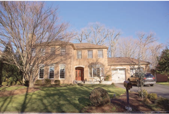
8 7709 Laurel Leaf Drive — $1,189,900