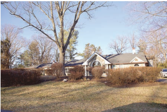
7 9101 Marseille Drive — $1,200,000