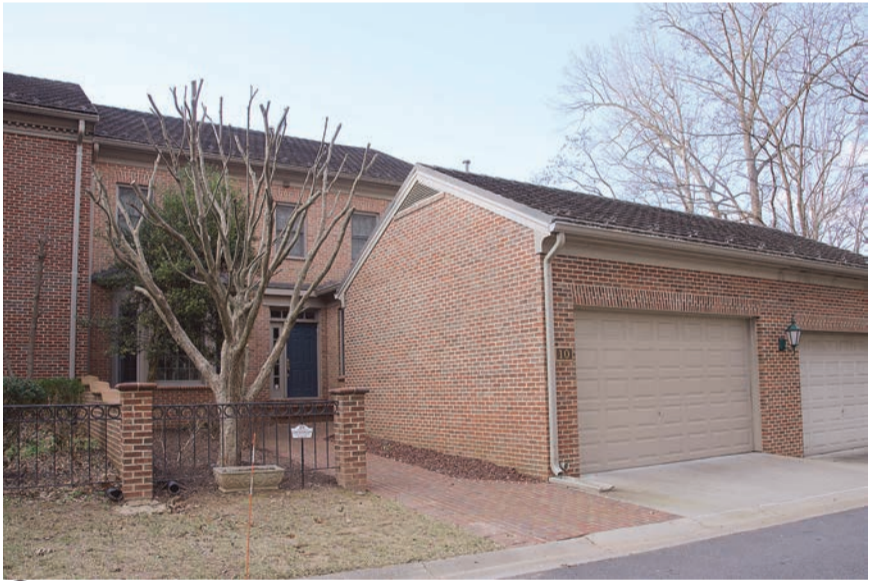
4 10 Gate Post Court — $1,230,000