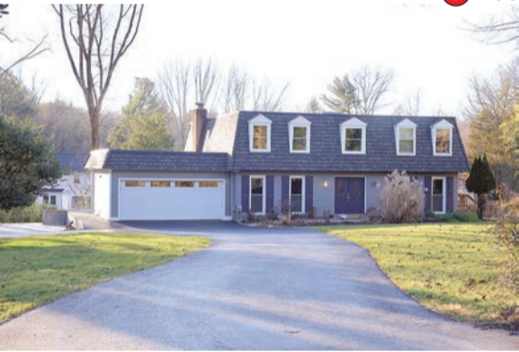
9 8574 Brickyard Road — $1,150,000

IN NOVEMBER, 2020, 61 POTOMAC HOMES SOLD BETWEEN $2,737,500-$550,000.