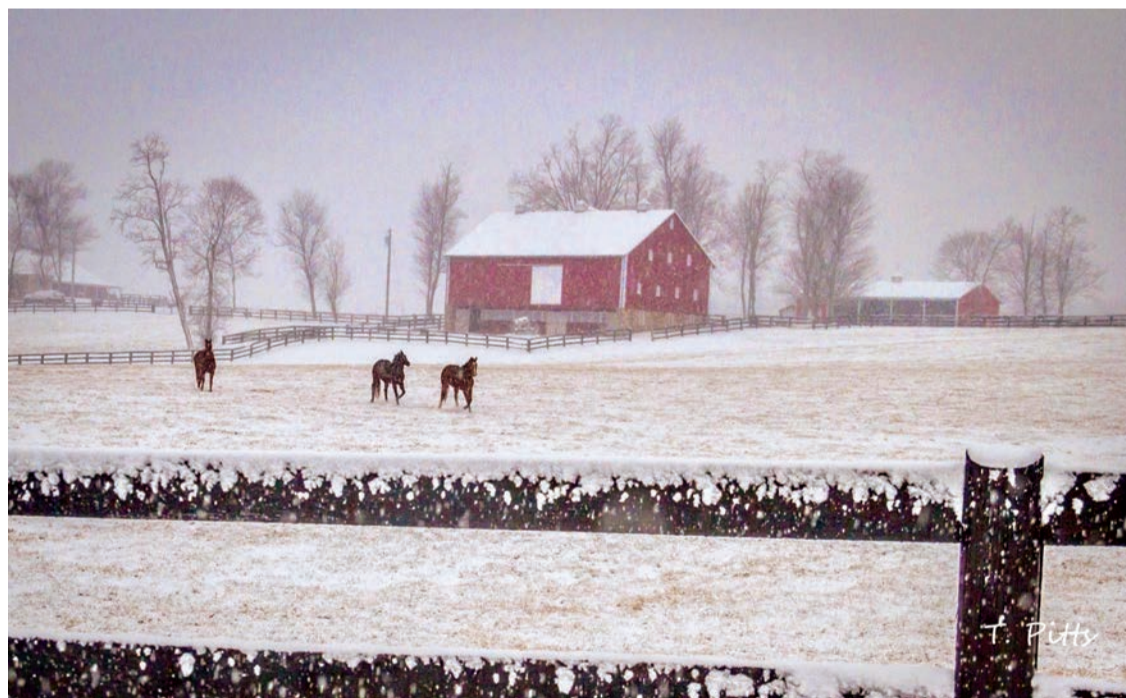
An initiative to permit the solar industry to plant industrial solar in the Agricultural Reserve will advance with restrictions. Here, part of the Reserve in Poolesville in the snow.