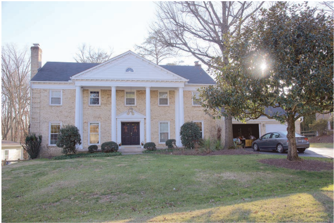
3 11220 Fall River Court — $1,320,000