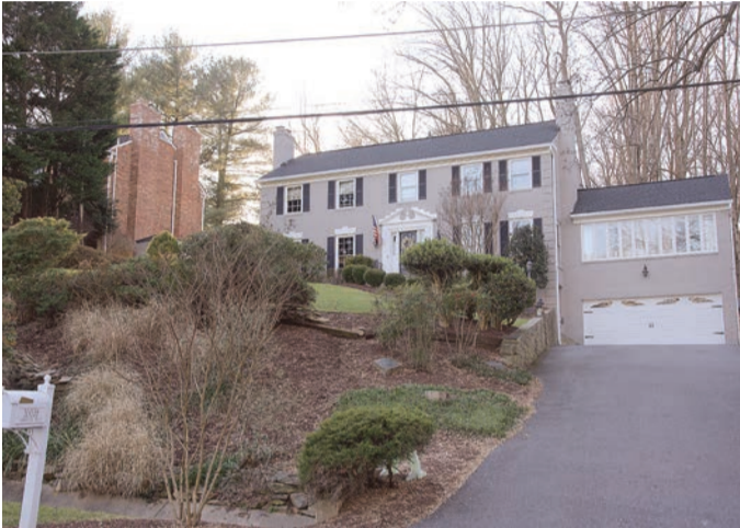
6 10038 Carmelita Drive — $1,219,000