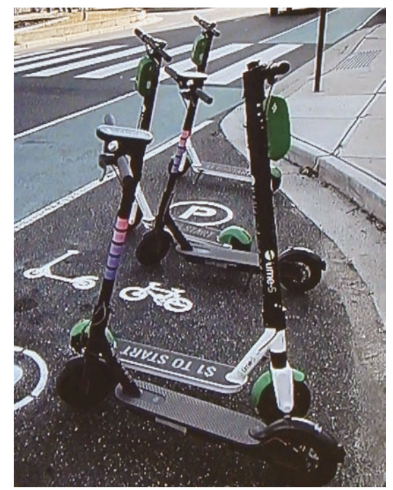
Some parked, Lime e-scooters awaiting new riders.

It was important for Fairfax to do so because – if it didn't renew the program or replace it with a regulating ordinance – under the Code of Virginia, these e-scooter companies would be permitted to operate without City permits. In the summer, two