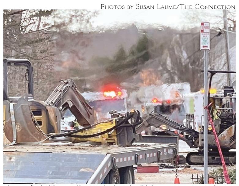
Flames fueled by gas line explosion rise high over Hooes Road in Springfield.