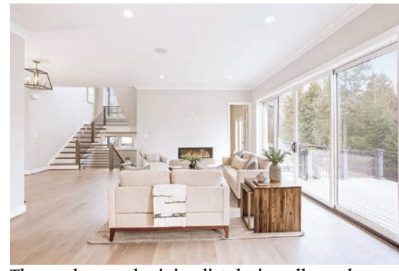
The modern and minimalist design allows the natural surroundings to be integrated into the décor at Park Grove in McLean.

they have only horizontal mullions, so we selected an interior door style that reiterated that shape.'