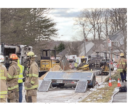
About 50 units of fire, ambulance, and police responded to the Feb. 3 incident.

Two homes evacuated were and power was shut off to the area as a safety precaution. Fire remained units on scene until the multiple lines feeding the damaged line could be shut off and the fire extinguished. The process took several hours with flames visible