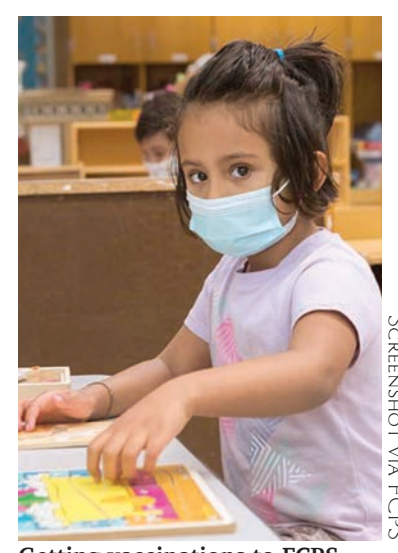
Getting vaccinations to FCPS employees who want them is critical to in-person learning.

ra. Given the eight votes of support to move forward with the consensus vote, the Board went ahead. Reading out the votes by name,