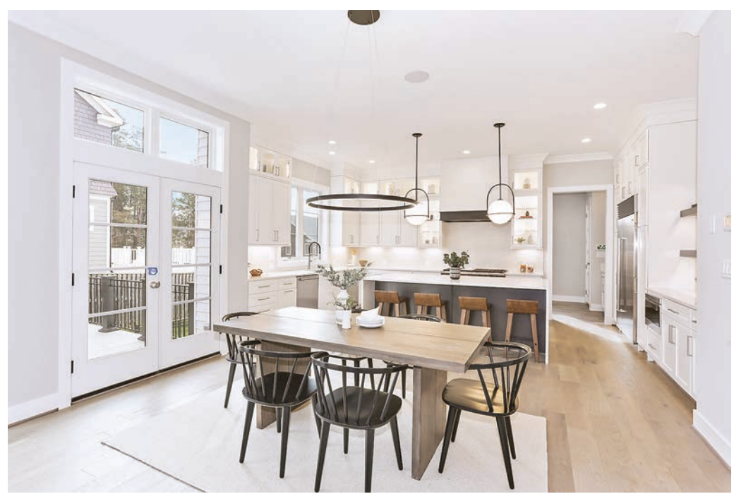
Like the kitchen, many of the rooms feature large windows, at Park Grove in McLean.