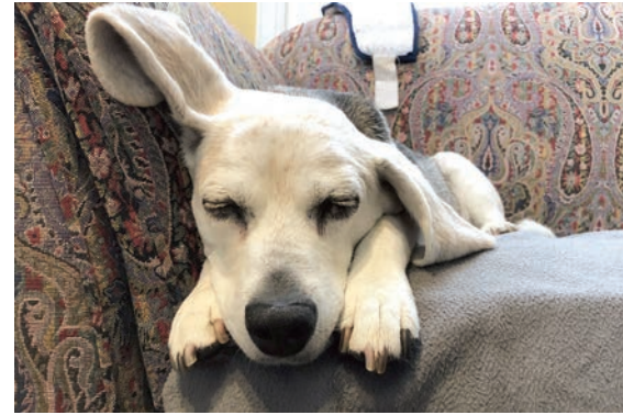
Any position will do.