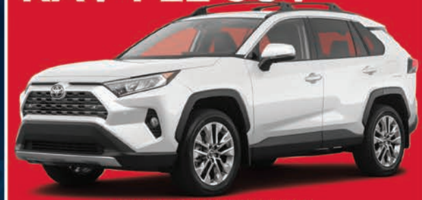
LEASES STARTING FROM..