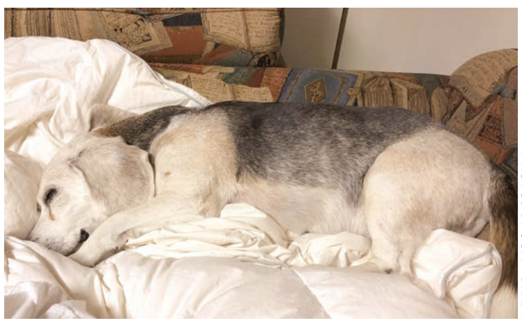
The scene of the most recent crime.

Animal Welfare League of Alexandria Animal Welfare League of Arlington Homeward Trails Lost Dog and Cat Rescue Foundation PetConnect Rescue Wolf Trap Animal Rescue