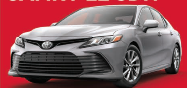
LEASES STARTING FROM..